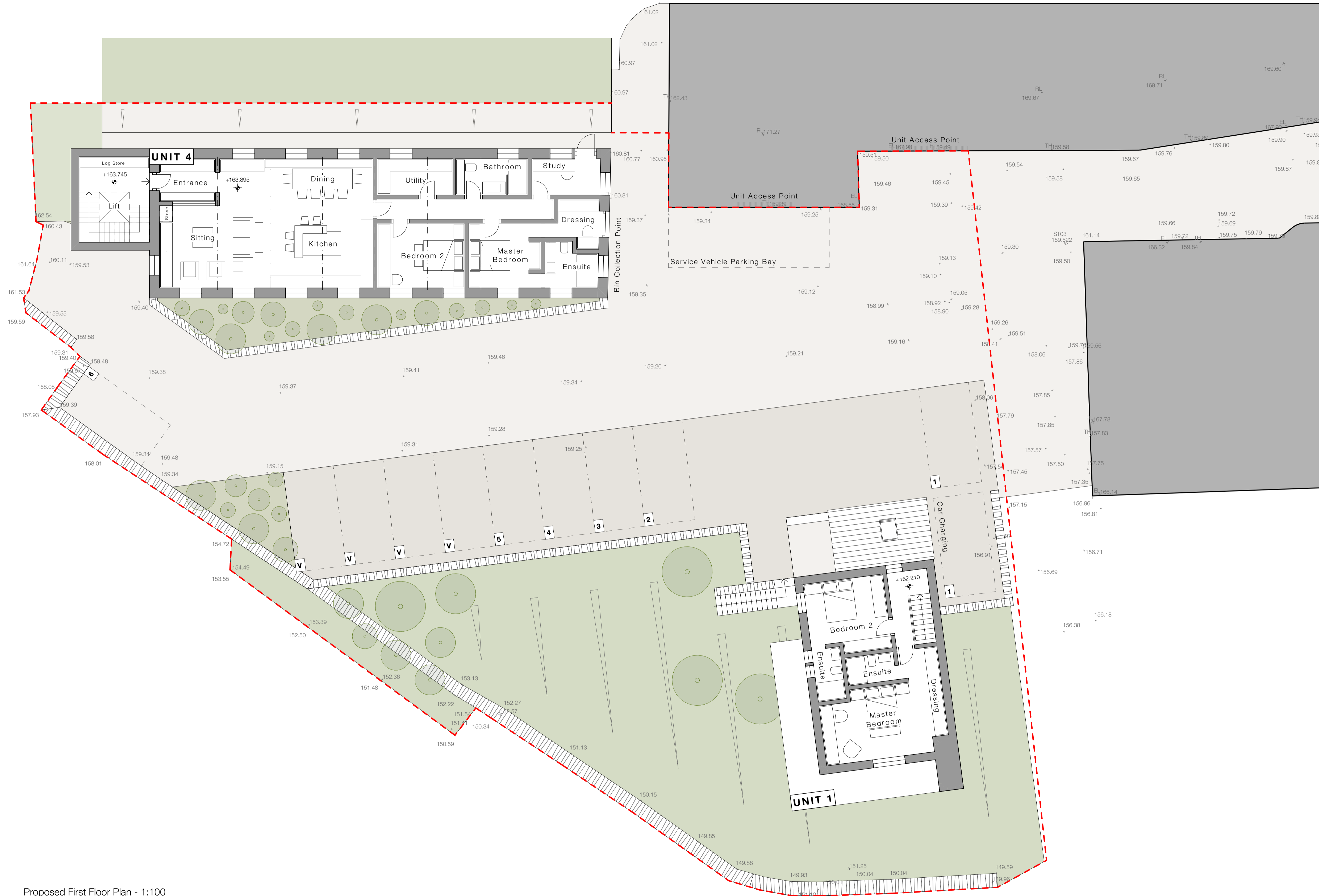
Proposed First Floor Plan - 1:100