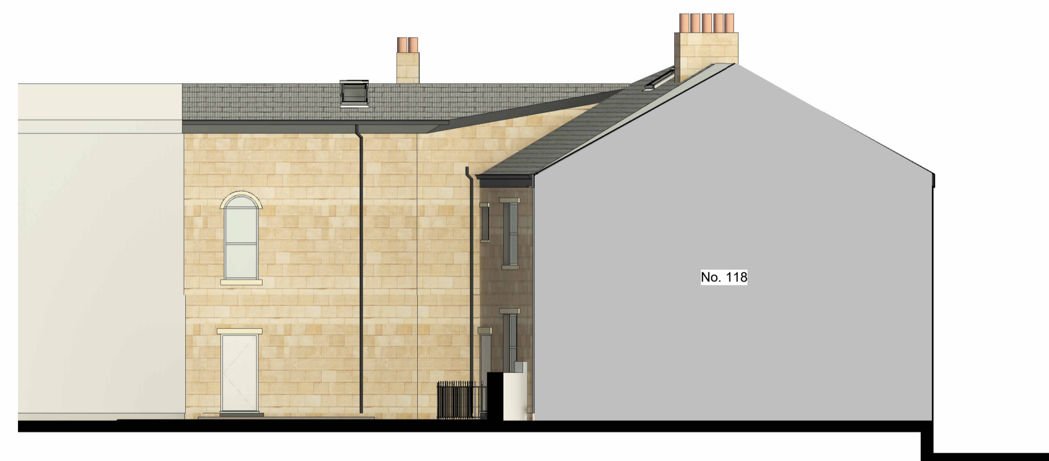
C - WEST ELEVATION REAR 1 : 100