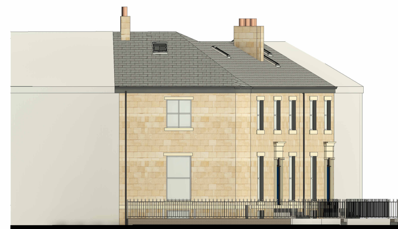
D - NORTH ELEVATION SIDE 2 1 : 100