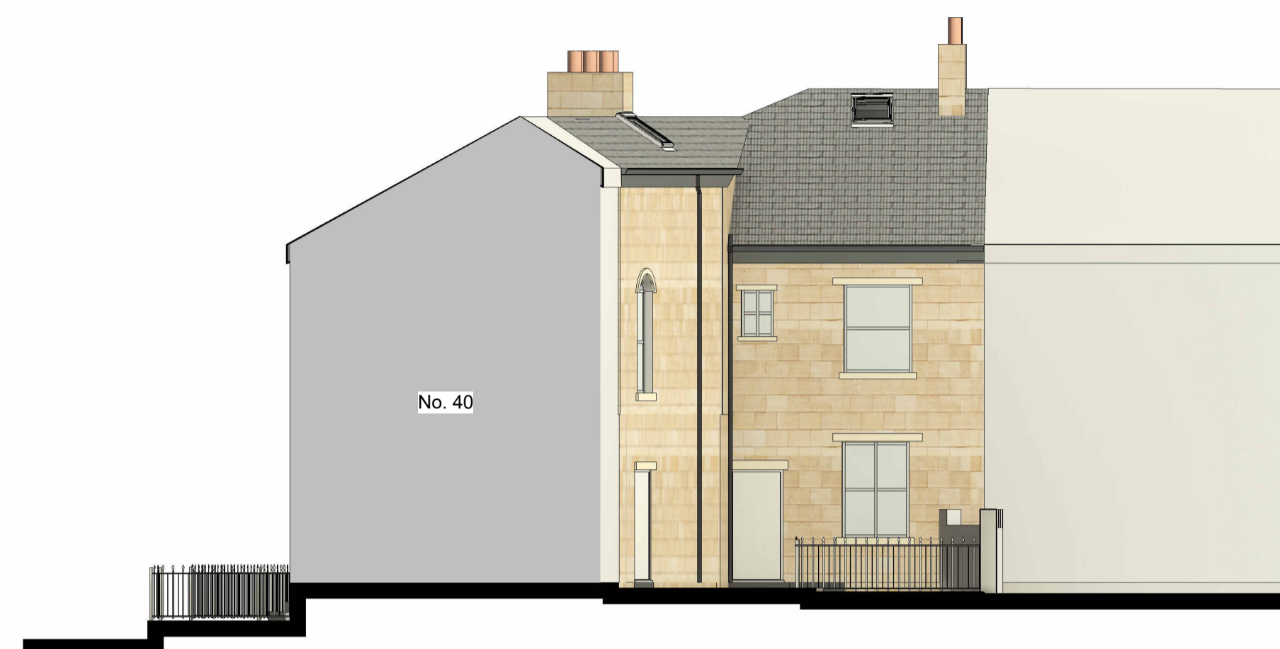
B - SOUTH ELEVATION SIDE 1 1 : 100