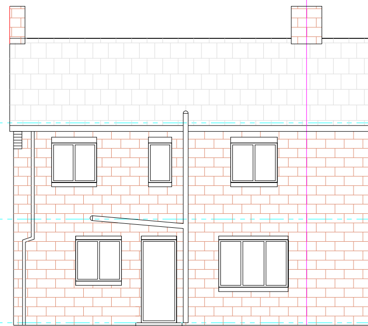
Rear Elevation (Existing)