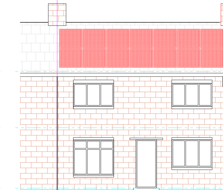
Front Elevation (Existing)