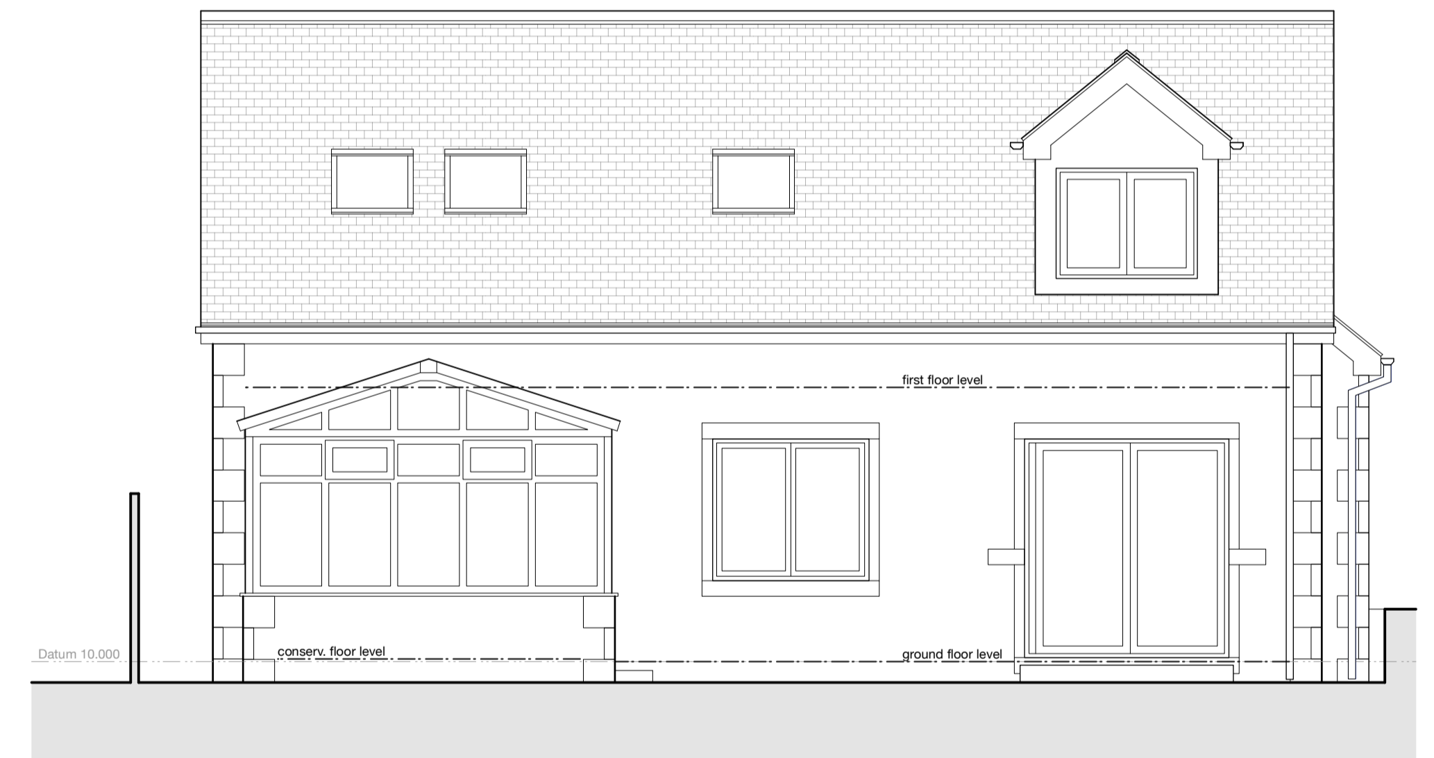
north elevation - rear

This drawing has been prepared specifically for the purpose of obtaining Planning Permission and/or Building Regulation Approval. Its suitability for other purposes, without supplementary details and specifications cannot be guaranteed. The Permissions and/or Approvals are beyond the Architects control, and no guarantee that such will be granted is given or to be inferred by reason of the preparation of this drawing. Only figured dimensions are to be used. All dimensions to be checked on site. This drawing together with the design is the property and copyright of the Architect and must not be reproduced without prior written permission.