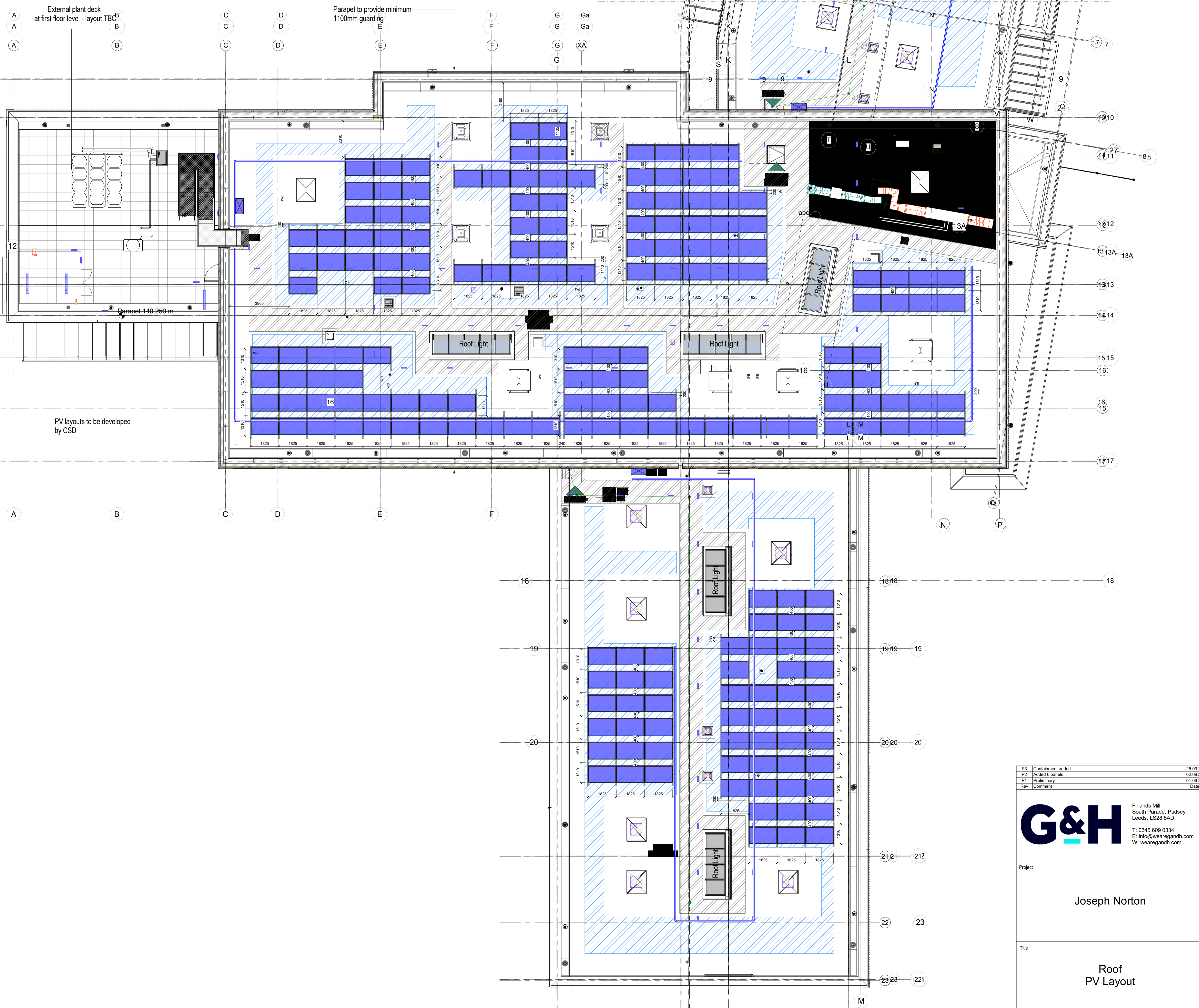
Roof - PV Layout 1:100