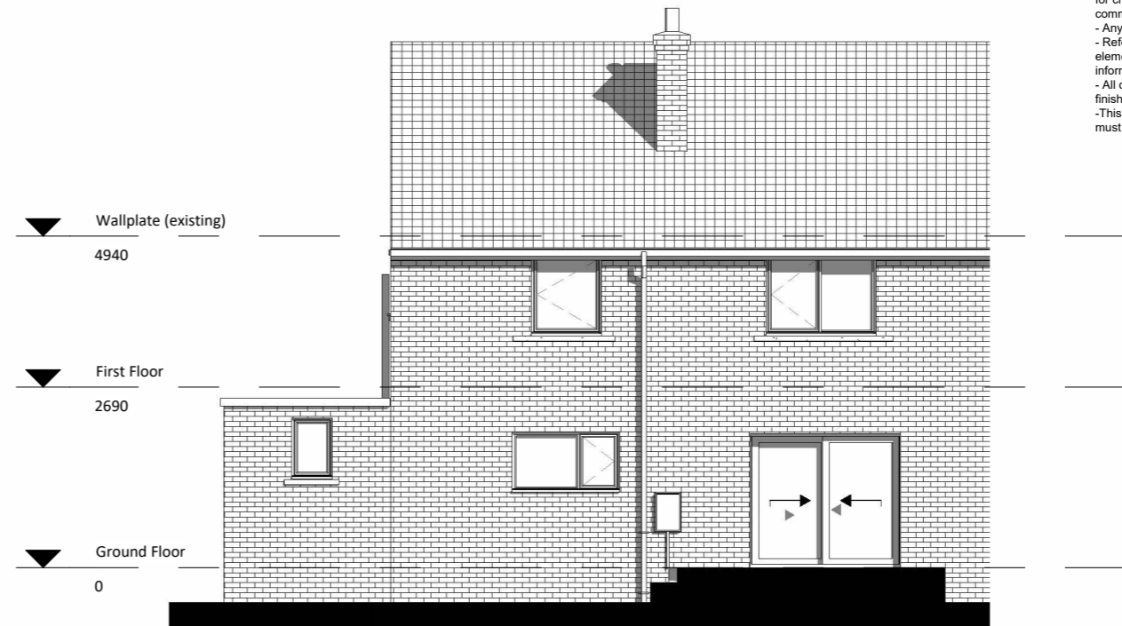
2 10 Rear Existing (NW)