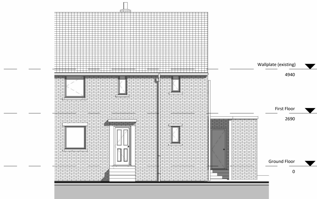
1 10 Front Existing (SE)

NOTES - Do not scale from this drawing. - Due to the nature of the project (existing property) dimensions may vary on site to those shown. - The contractor and any specialist designers are responsible for checking all dimensions, tolerances etc before works commence or any materials are ordered / manufactured - Any discrepancies to be referred to the designer. - Refer to structural engineers drawings for all structural elements. Structural elements denoted on this drawing are for information only. - All dimensions are structural i.e. before plaster or other finishes unless stated otherwise - This drawing is copyright of Stonehouse Architectural Ltd and must not be reproduced without authorisation.