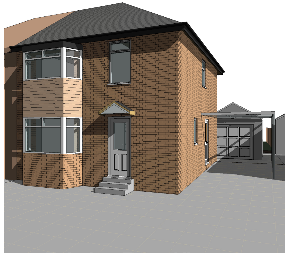
Existing Front View