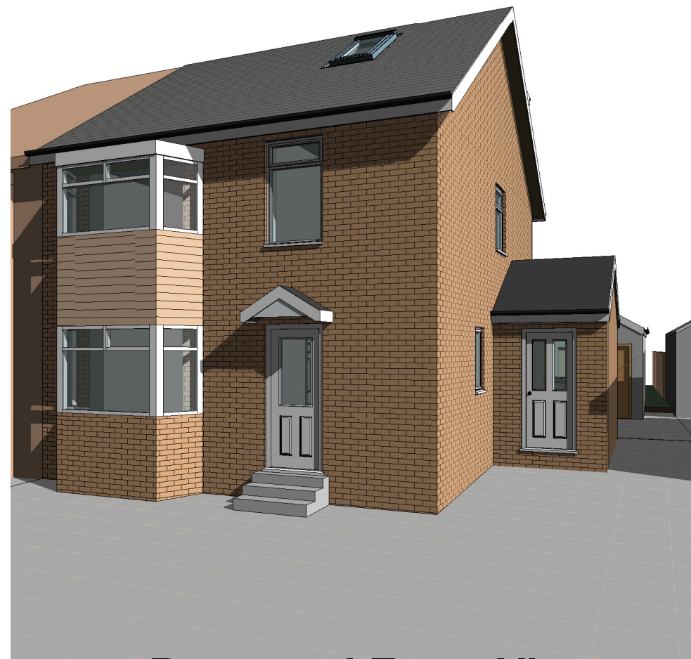
Proposed Front View