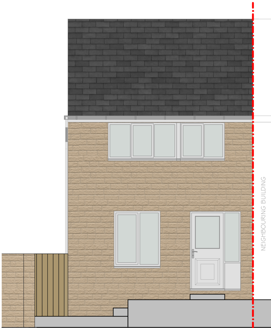
EXISTING REAR ELEVATION 1:50@A3