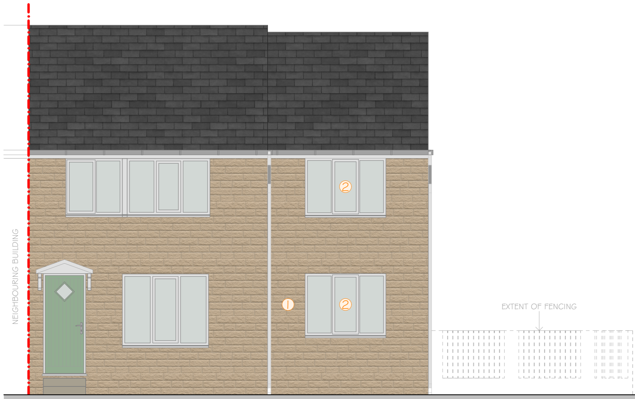
PROPOSED FRONT ELEVATION 1:50@A3