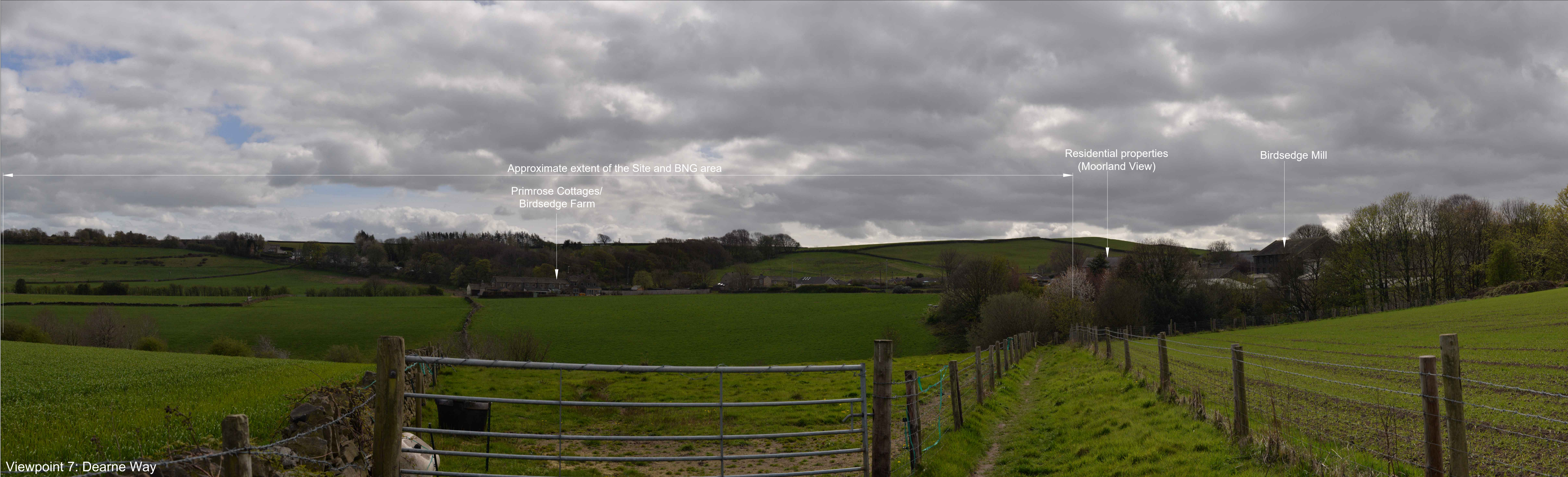
Viewpoint 7: Dearn Way