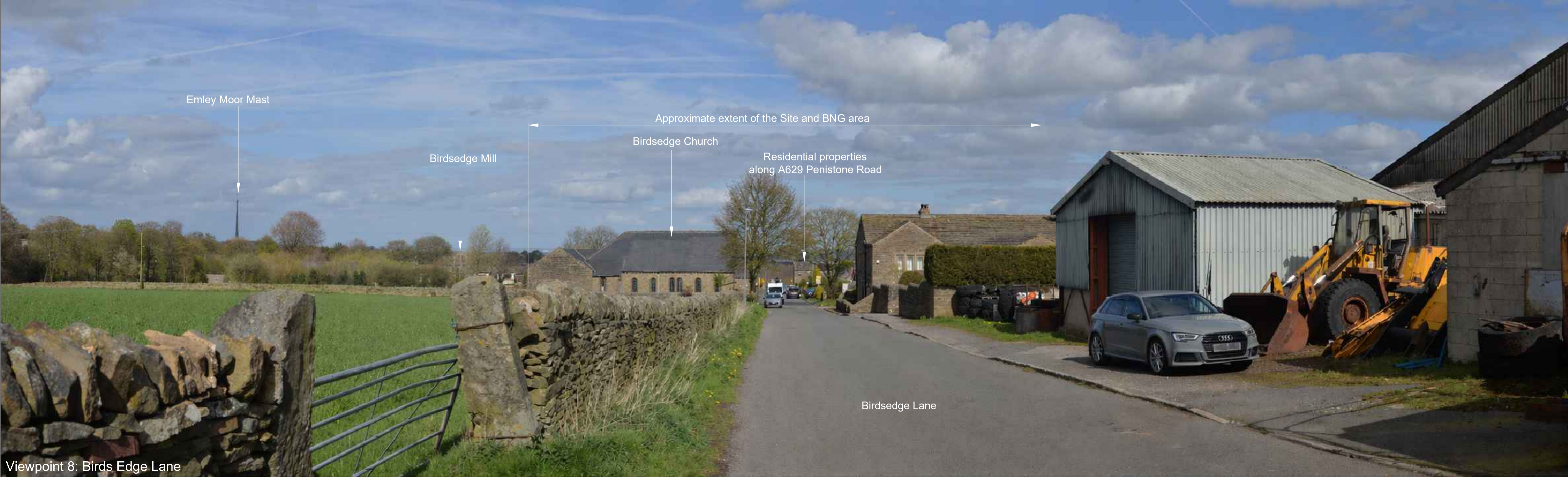
Viewpoint 8: Birds Edge Lane