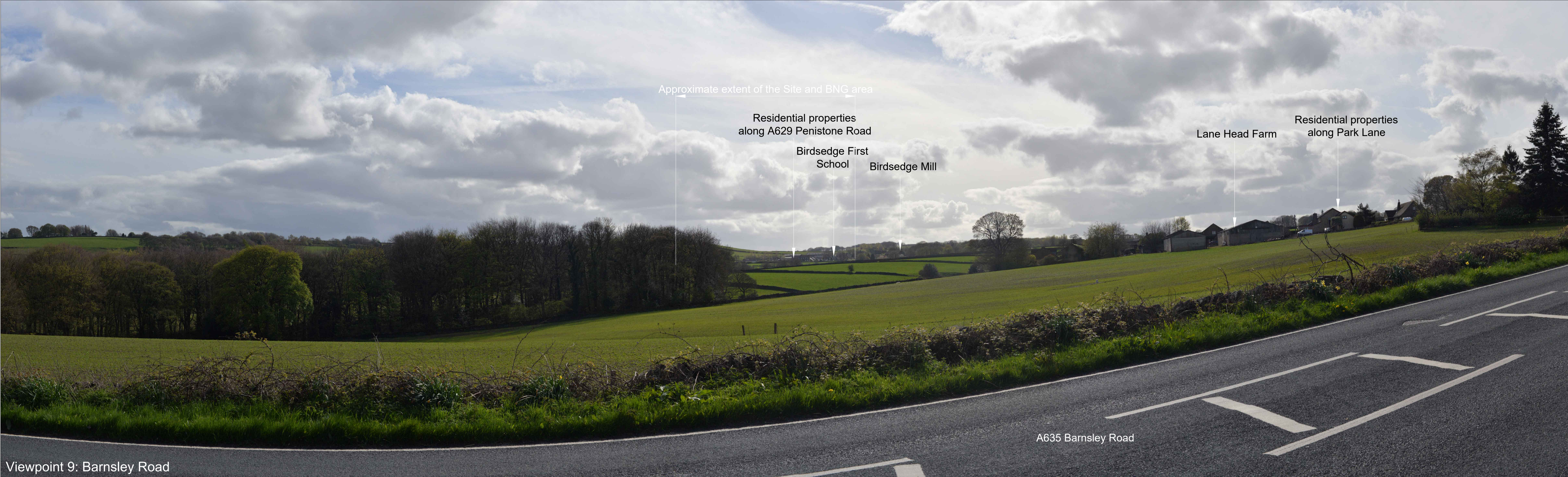
Viewpoint 9: Barnsley Road