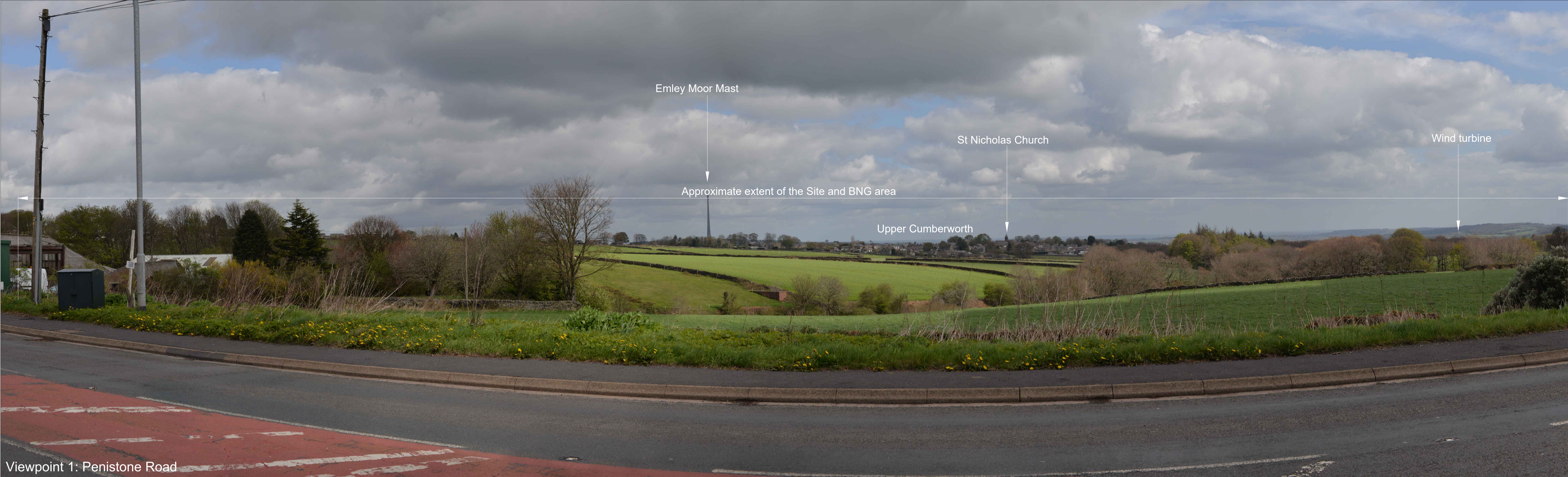
Viewpoint 1: Penistone Road