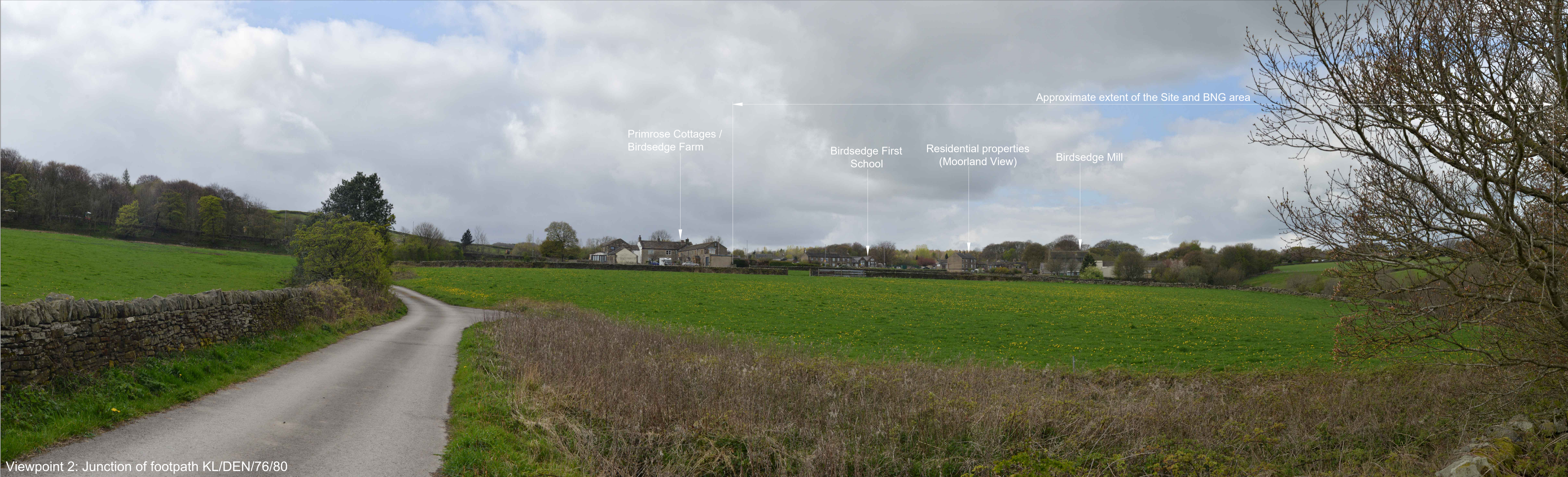
Viewpoint 2: Junction of footpath KL/DEN/76/80