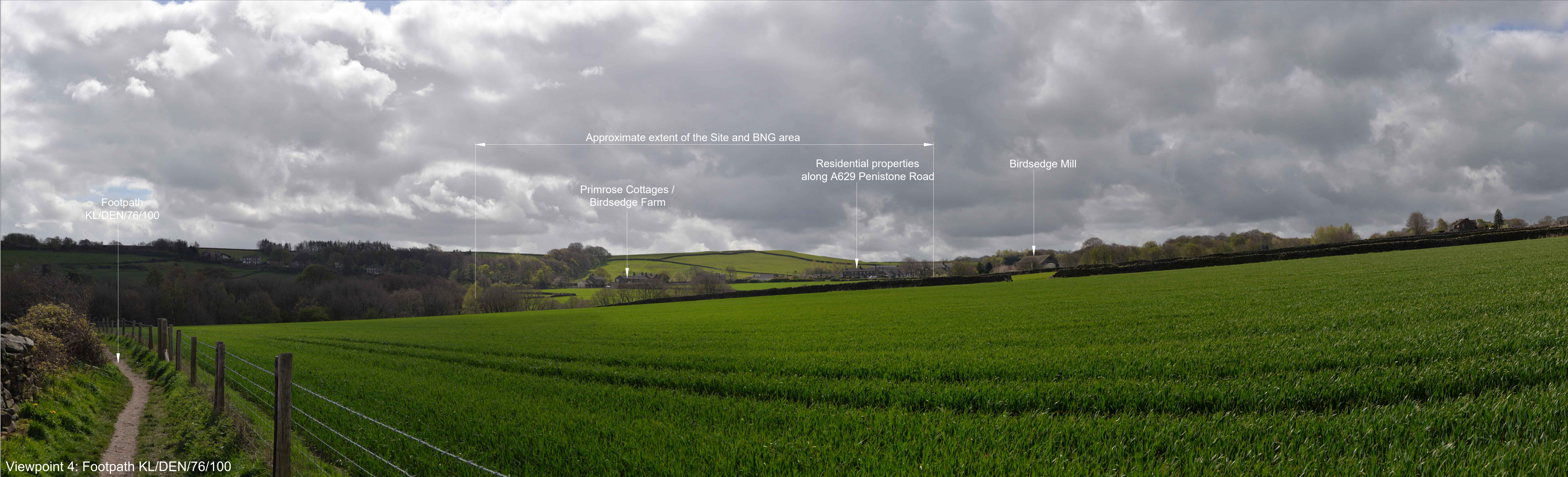
Viewpoint 4: Footpath KL/DEN/76/100