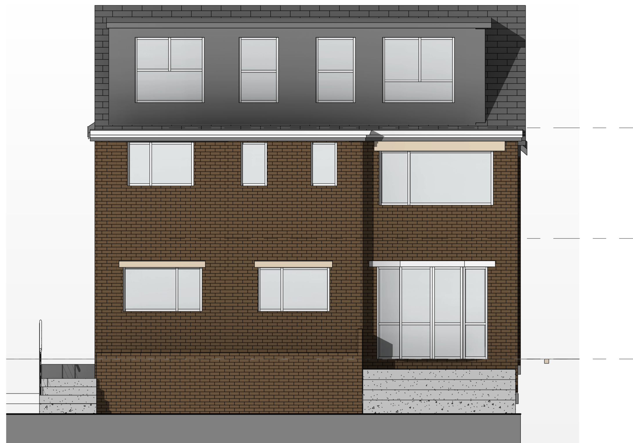
2 Rear Elevation 1 : 50