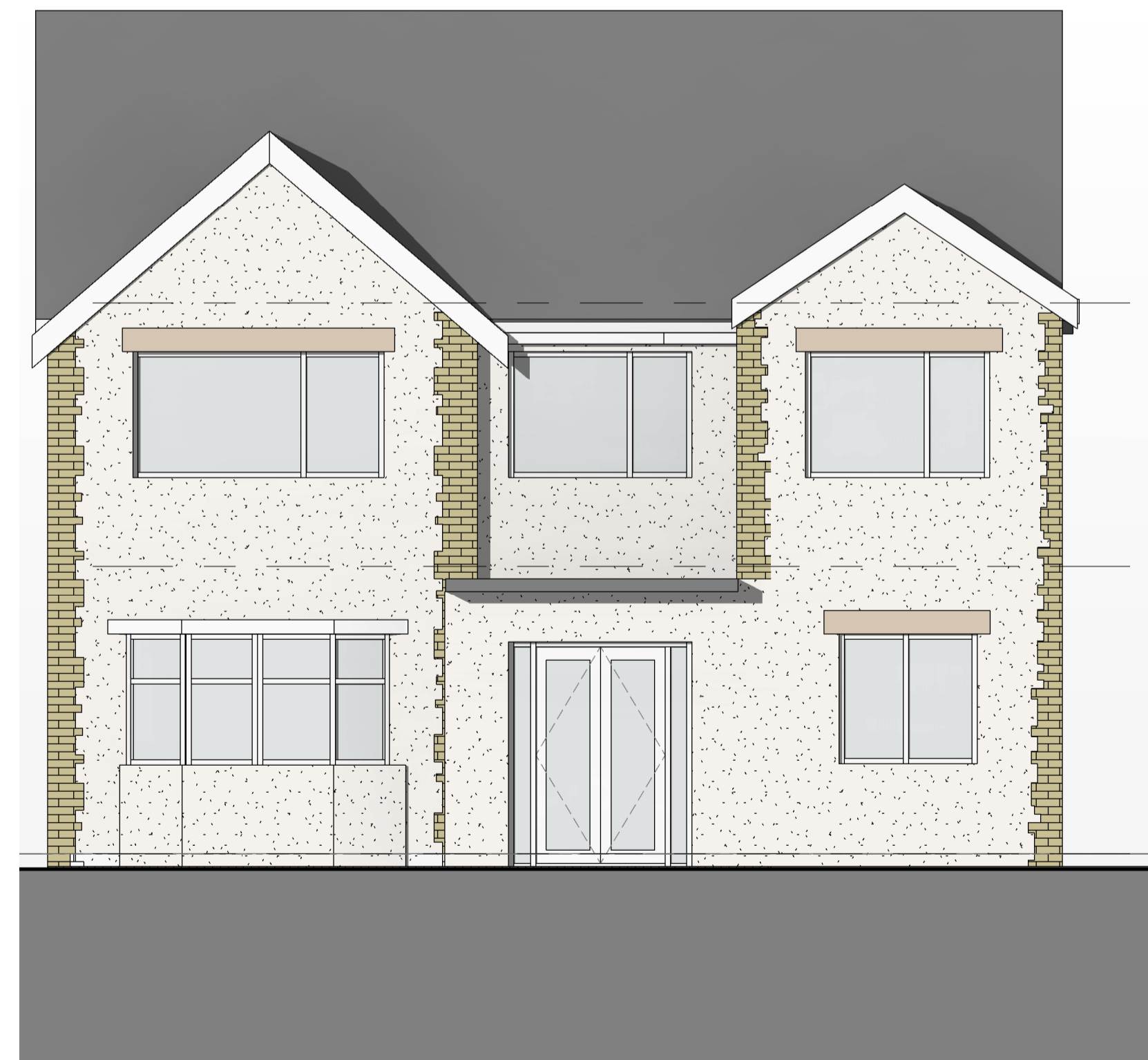
1 Front Elevation 1 : 50

Location Plan North Point The contractor must verify all dimensions on site before commencing any work or fabrication drawings. If this drawing exceeds the quantities taken in any way Unite Designs are to be informed before the work is initiated. Only figured dimensions are to be taken from this drawing. Do not scale off this drawing. Drawings are based on Ordnance Survey and / or existing record drawings - design and drawing content is subject to detailed Site Survey, Structural Survey, Site Investigations, Planning and Statutory Requirements and Approvals. Authorised reproduction from Ordnance Survey Map with permission of the Controller of Her Majesty's Stationery Office. Crown Copyright reserved. Unite Designs Copyright.