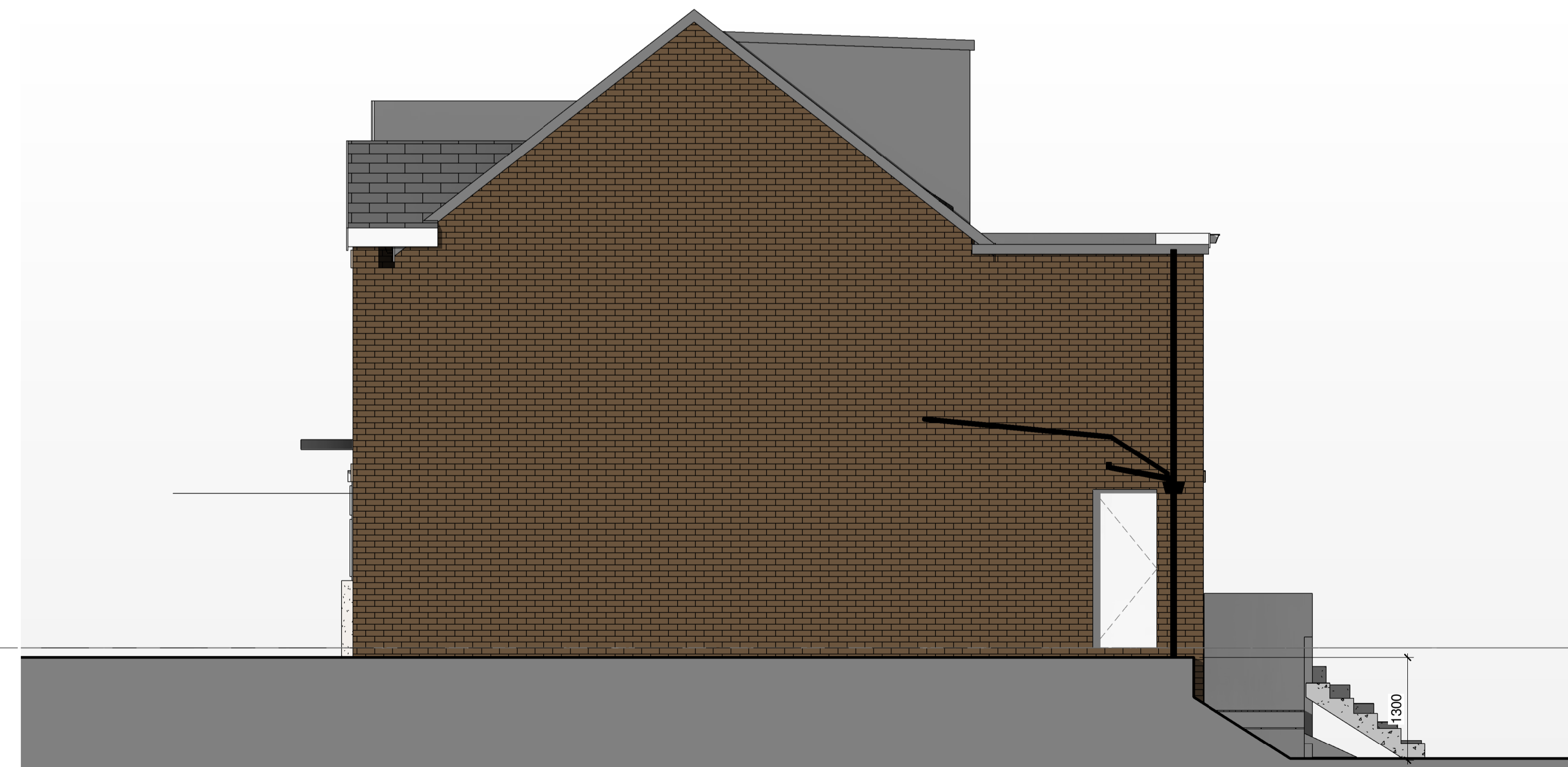
3 Side Elevation 1 : 50