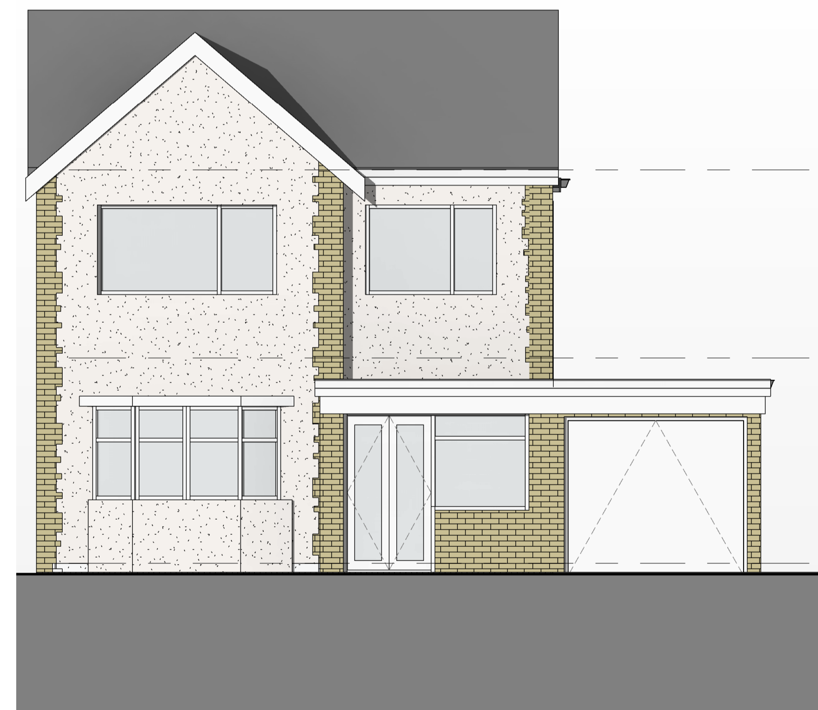
1 Front Elevation 1 : 50