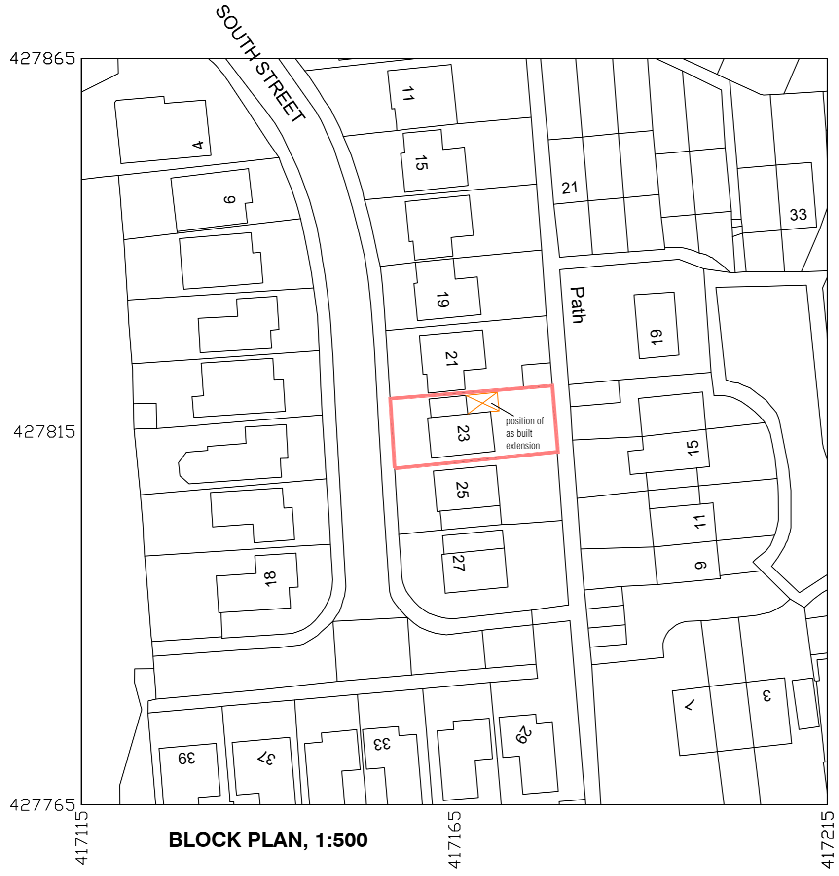
BLOCK PLAN, 1:500