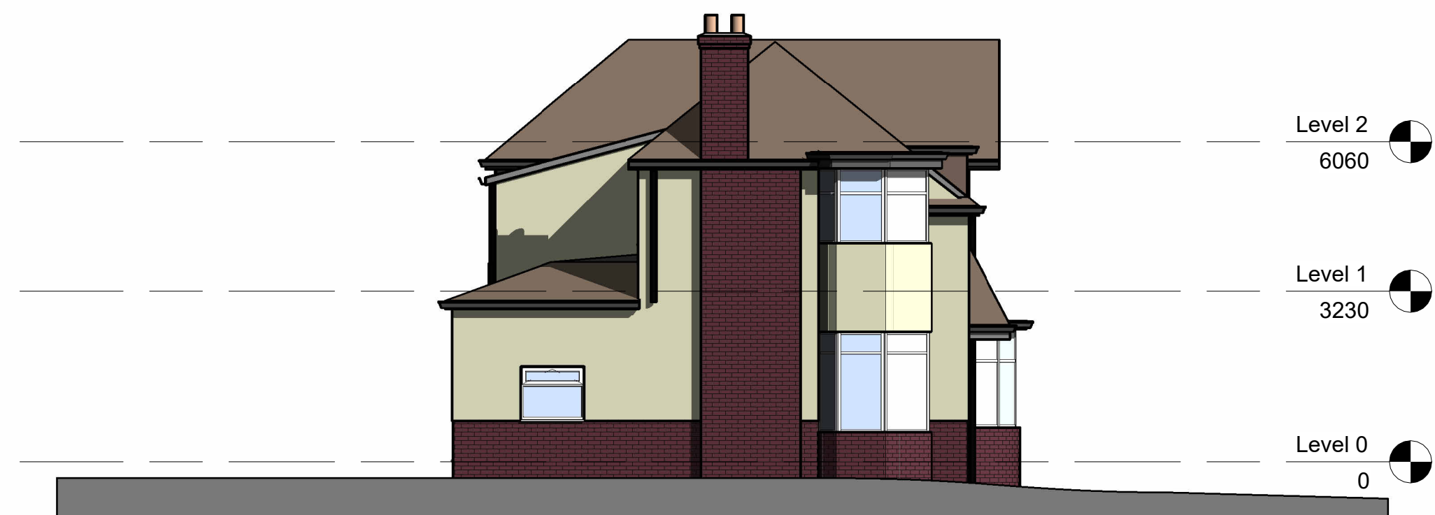
Side Elevation - West 1 : 100