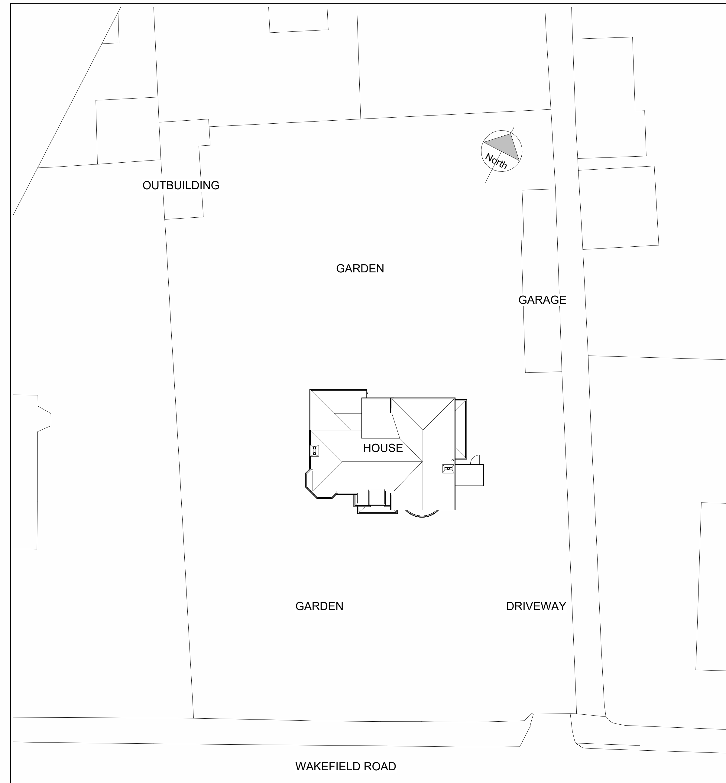
Site Plan 1 : 200