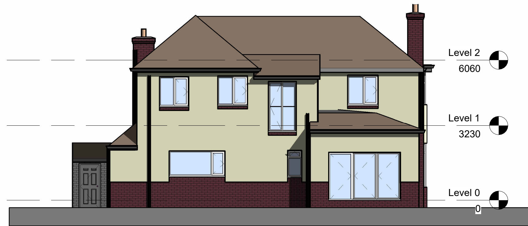
Rear Elevation - North 1 : 100