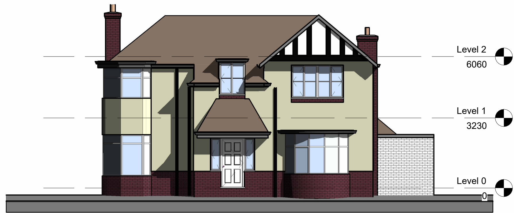
Front Elevation - South 1 : 100