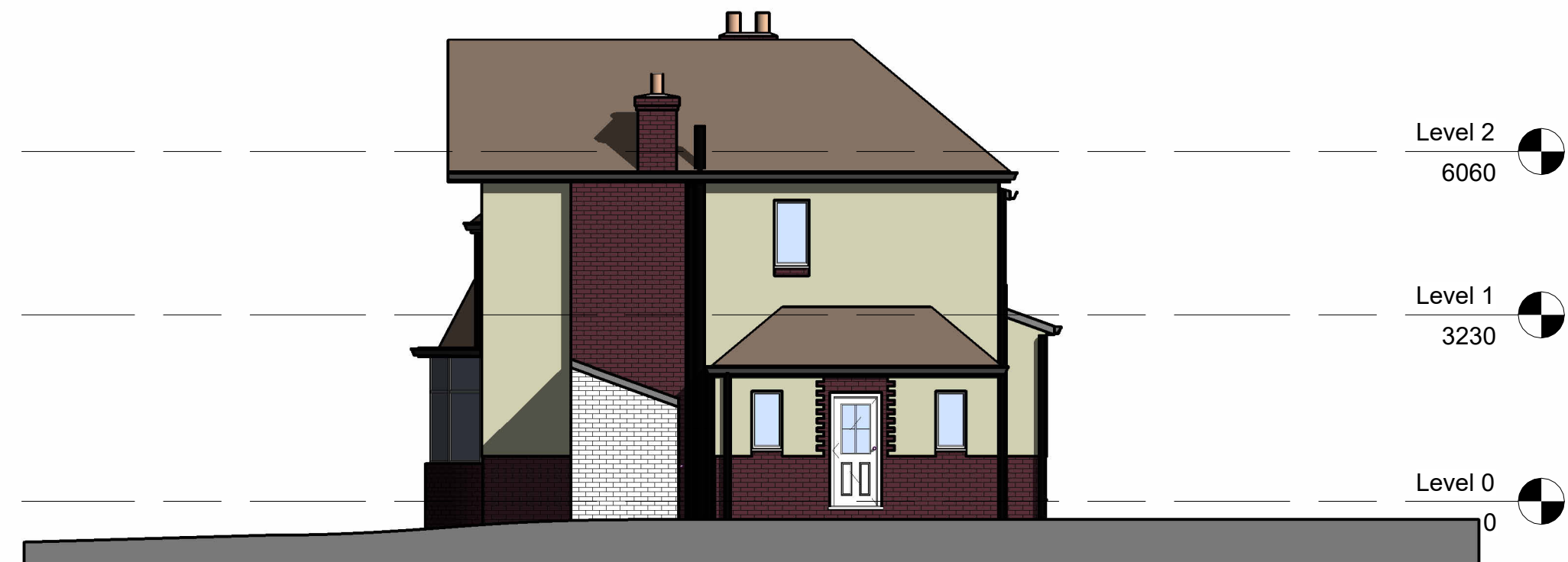
Side Elevation - East 1 : 100