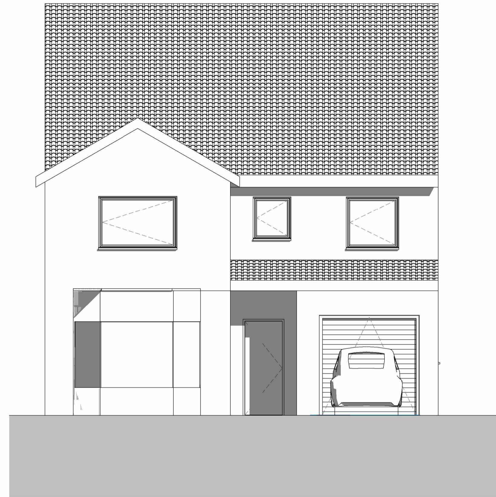
Existing South South West Elevation (Front) 1 : 50