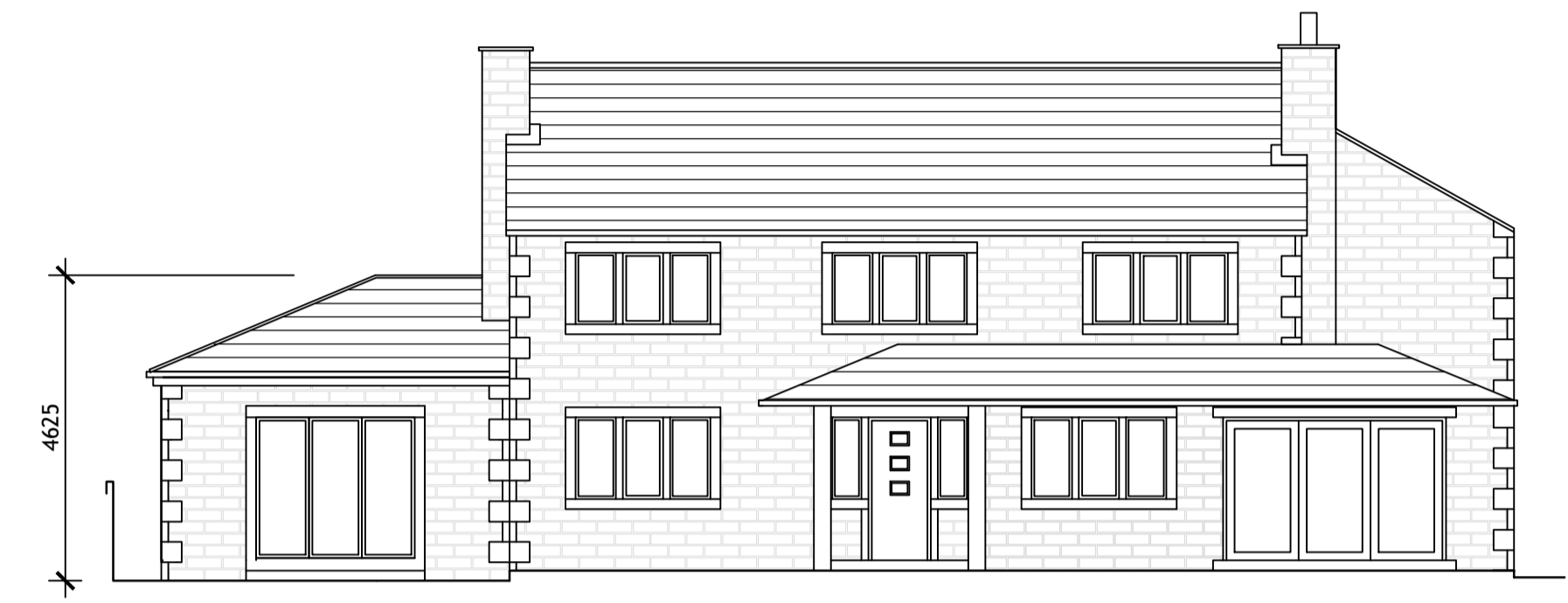
FRONT ELEVATION (South)