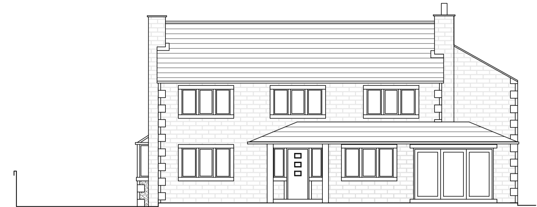
FRONT ELEVATION (South)