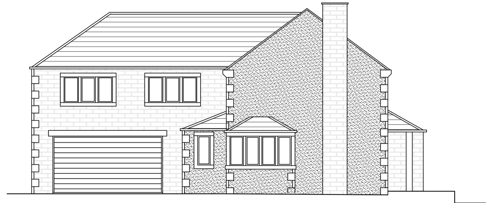
SIDE ELEVATION (West)