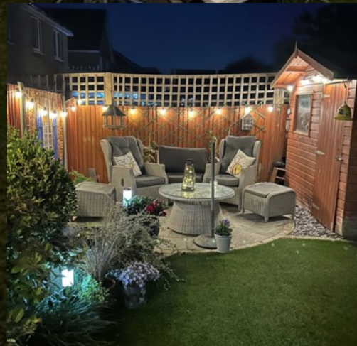
Functional and attractive garden lighting