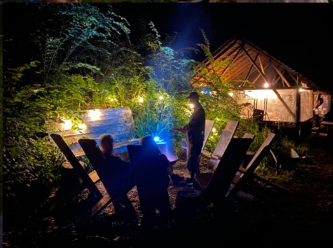
Create atmosphere around a fire pit – literally anywhere