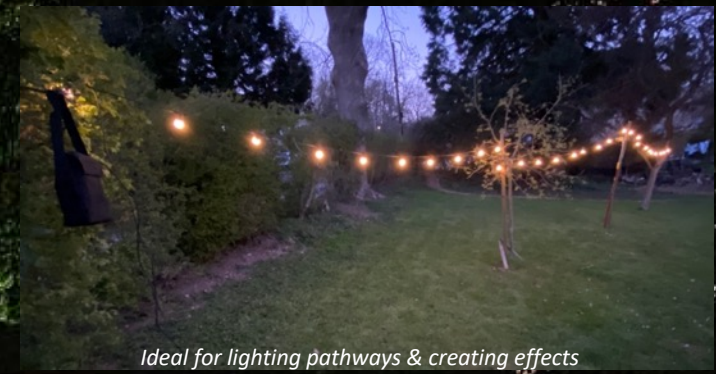
Ideal for lighting pathways & creating effects

Use instead of chandeliers for a marquee party. Also use for market & merchandising stalls