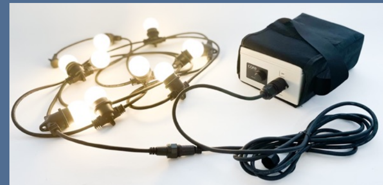
EnergyPoint battery supplied in bag to carry or hang from the handle