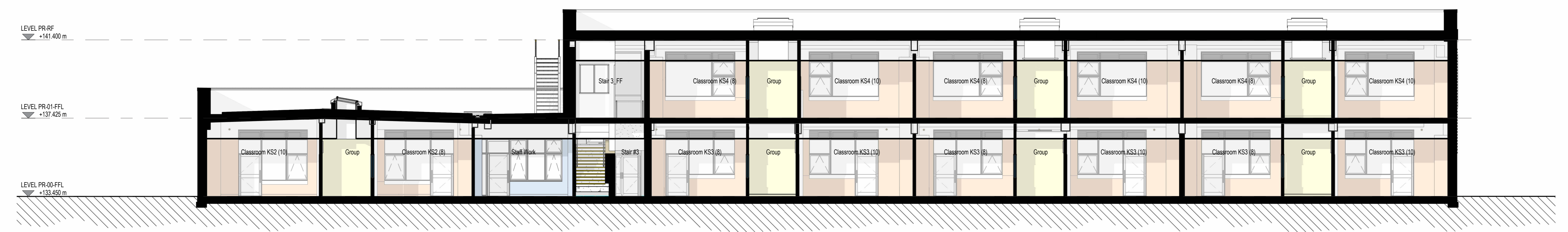
S6 SECTION S6 10121 1 : 100 GA Section - S6 - Dependent 1