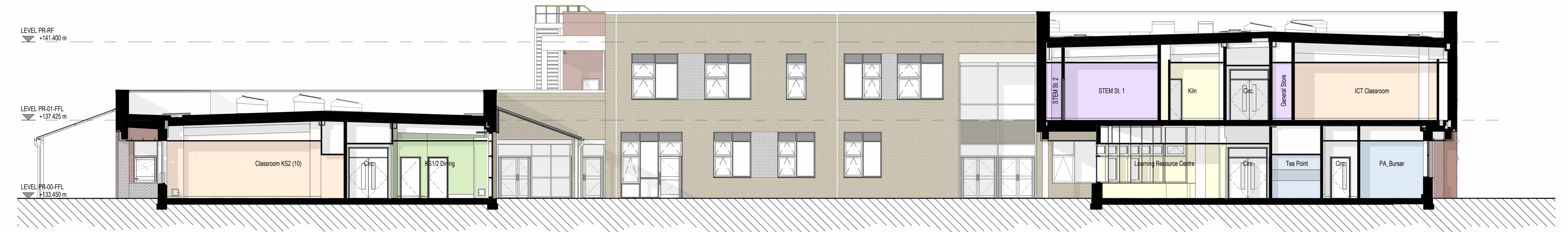
S5 SECTION S5 10121 1 : 100 GA Section - S5 - Dependent 1