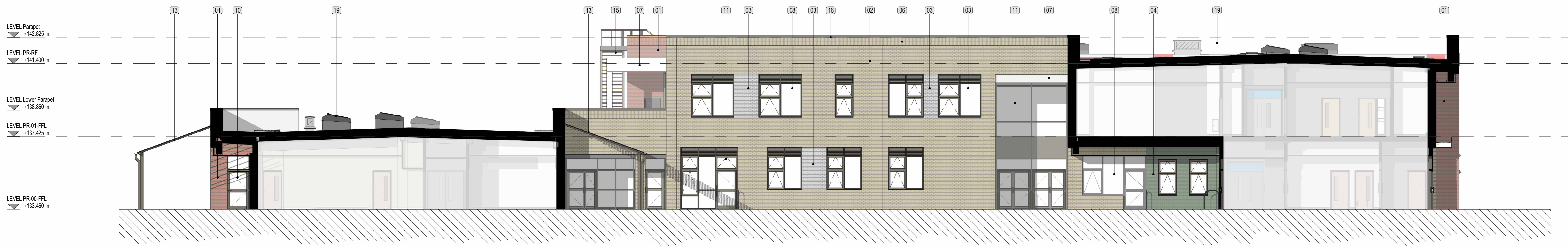
7 ELEVATION 7 10111 1 : 100 GA East Courtyard Planning Elevation