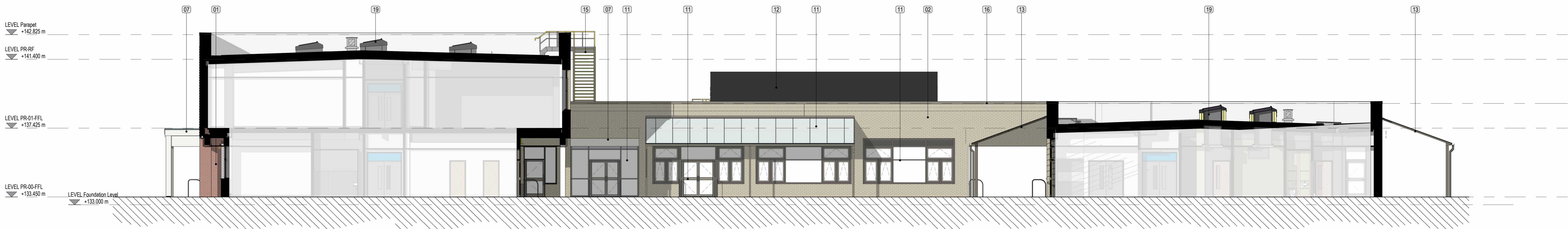
5 ELEVATION 5 10111 1 : 100 GA West Courtyard Planning Elevation