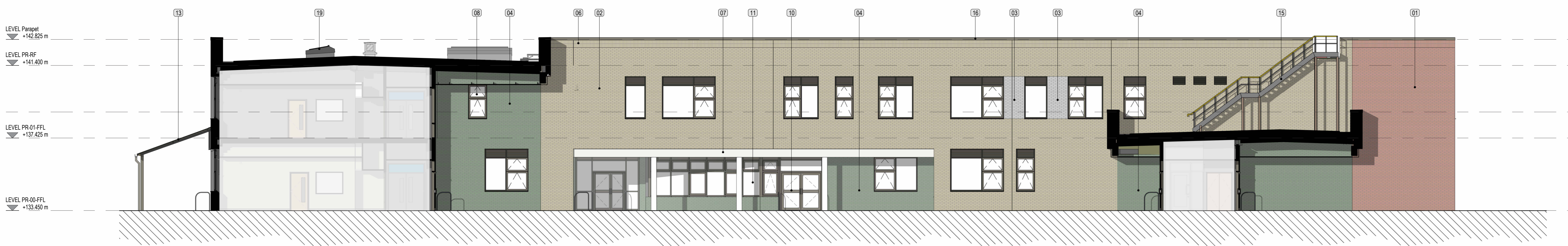
8 ELEVATION 8 10111 1 : 100 GA South Courtyard Planning Elevation