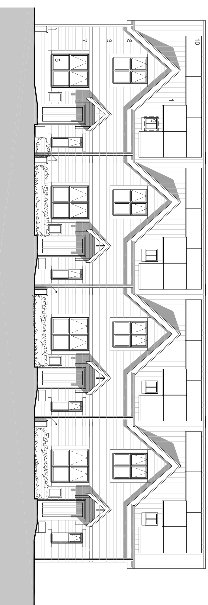
west facing elevation scale 1 : 100 @ A3