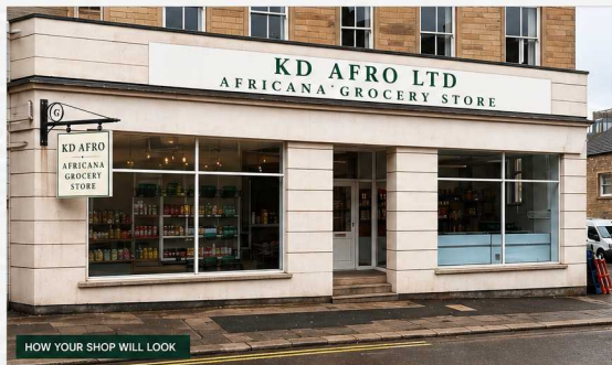
HOW YOUR SHOP WILL LOOK