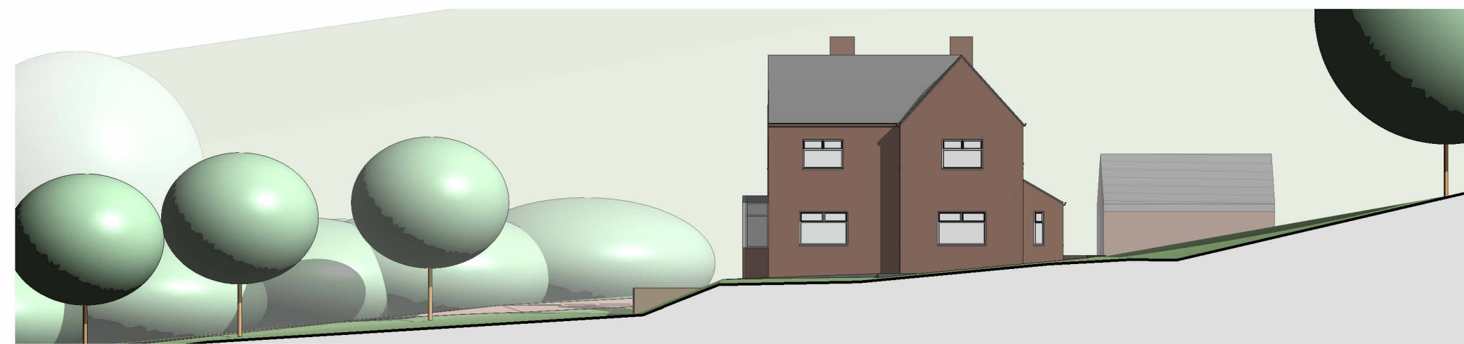
Existing Site Section B-B 1:200