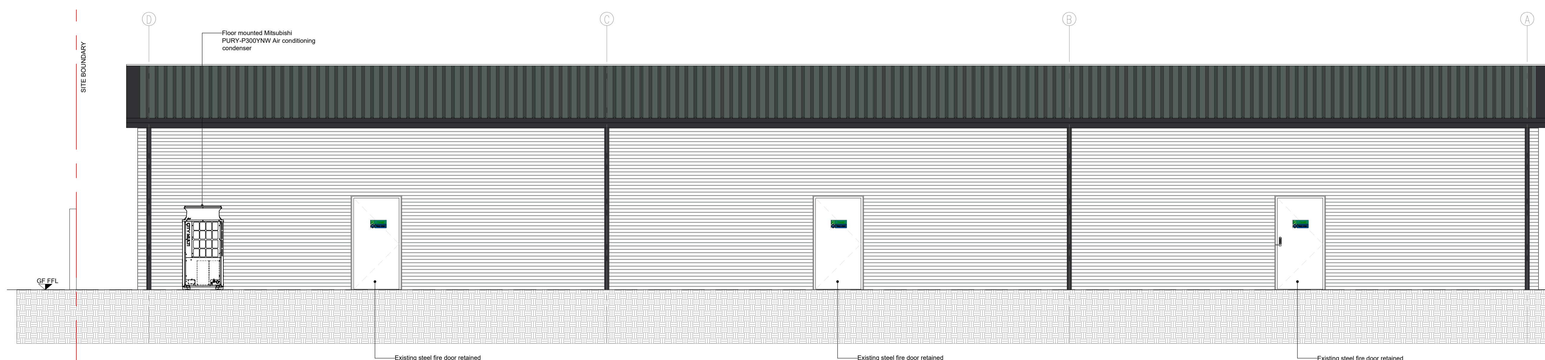
PROPOSED NORTH WEST (REAR) ELEVATION 1:50 @ A1