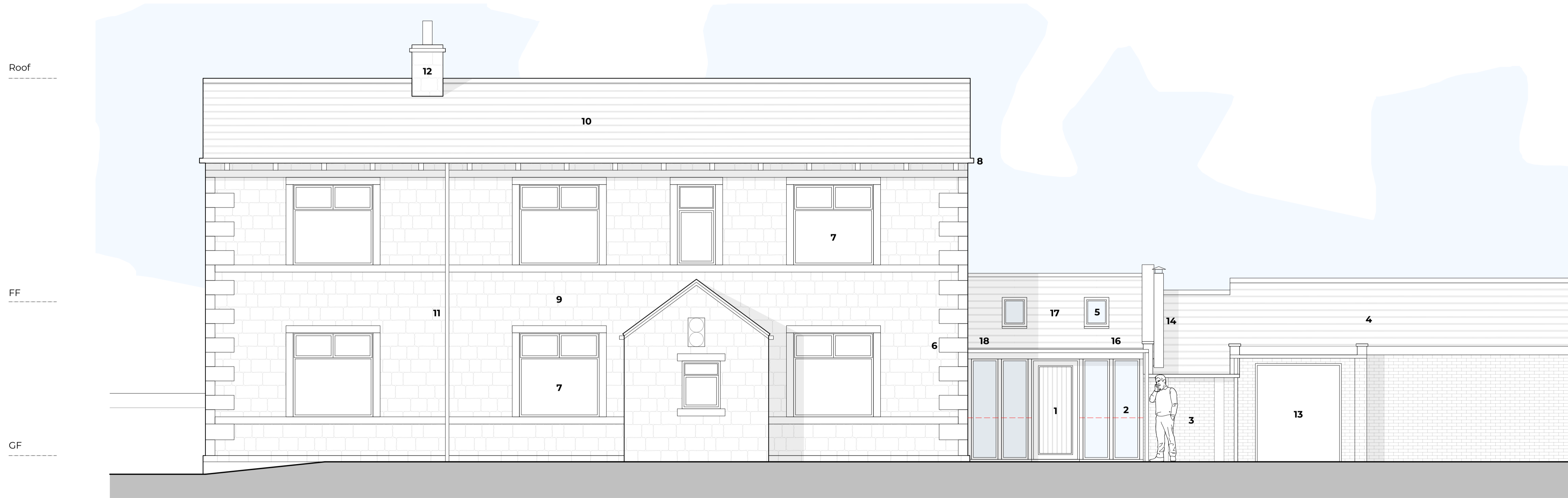
PR Proposed South Elevation 01