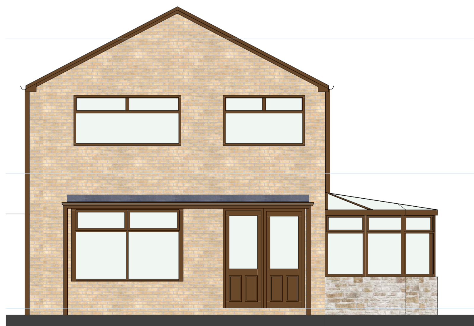
E-03 Elevation 1:50