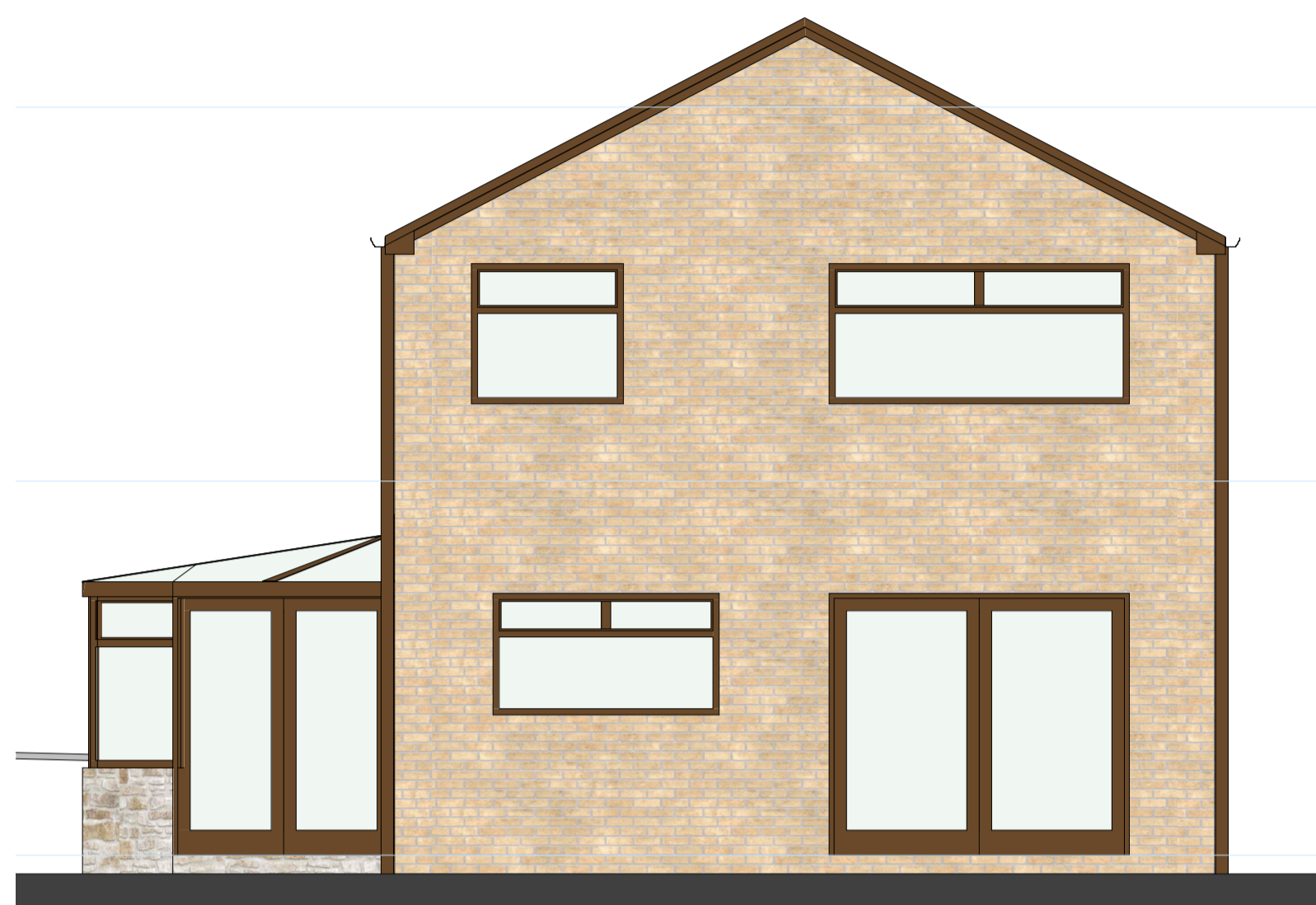
E-01 Elevation 1:50

THE CLIENT IS AT RISK IF ANY WORKS ARE STARTED PRIOR TO Key Stage BY APPOINTED BUILDING CONTROL BODY.