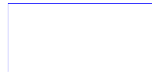
ROOF PLAN 1:200

PROPOSED NEW GARAGE Plans and Elevations as Proposed