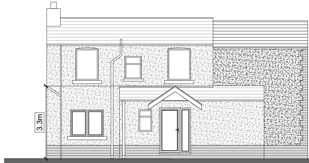
Site Section AA - Scale 1:100