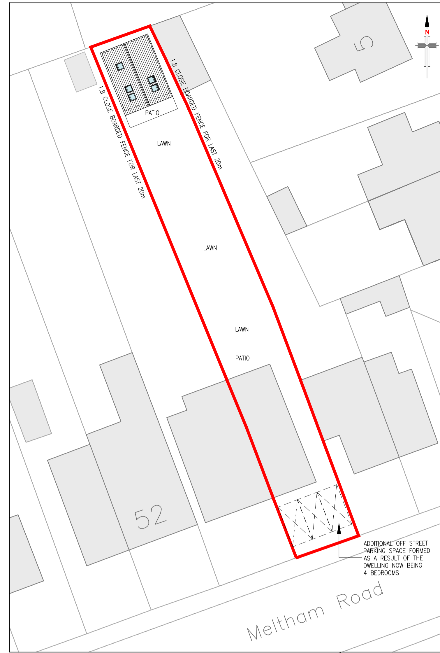
Proposed Site Layout Scale 1:250