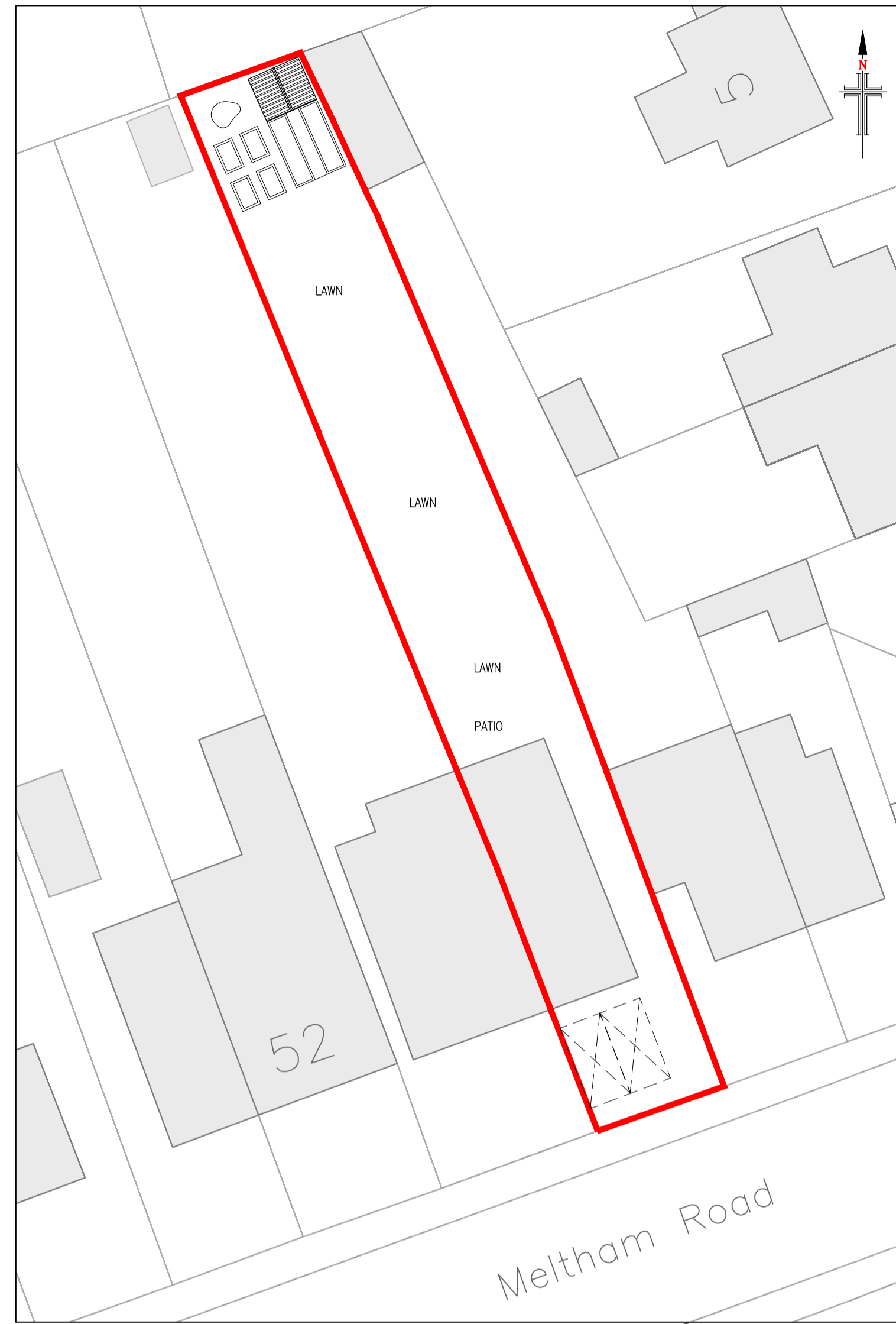
Existing Site Layout Scale 1:250