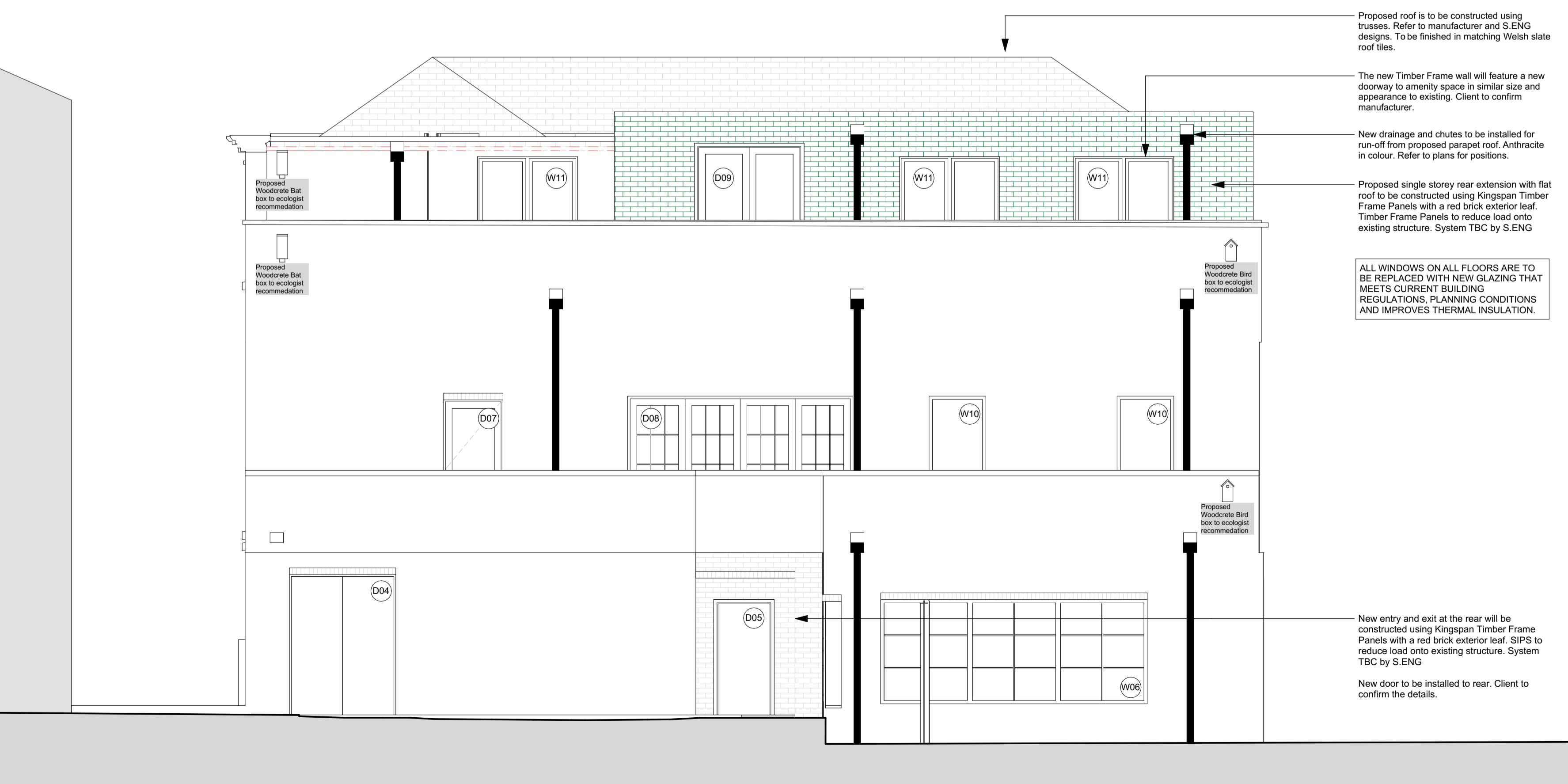
Proposed West Elevation 1:50

Proposed roof is to be constructed using trusses. Refer to manufacturer and S.ENG designs. To be finished in matching Welsh slate roof tiles. The new Timber Frame wall will feature a new doorway to amenity space in similar size and appearance to existing. Client to confirm manufacturer. New drainage and chutes to be installed for run-off from proposed parapet roof. Anthracite in colour. Refer to plans for positions. Proposed single storey rear extension with flat roof to be constructed using Kingspan Timber Frame Panels with a red brick exterior leaf. Timber Frame Panels to reduce load onto existing structure. System TBC by S.ENG ALL WINDOWS ON ALL FLOORS ARE TO BE REPLACED WITH NEW GLAZING THAT MEETS CURRENT BUILDING REGULATIONS, PLANNING CONDITIONS AND IMPROVES THERMAL INSULATION. New entry and exit at the rear will be constructed using Kingspan Timber Frame Panels with a red brick exterior leaf. SIPS to reduce load onto existing structure. System TBC by S.ENG New door to be installed to rear. Client to confirm the details.