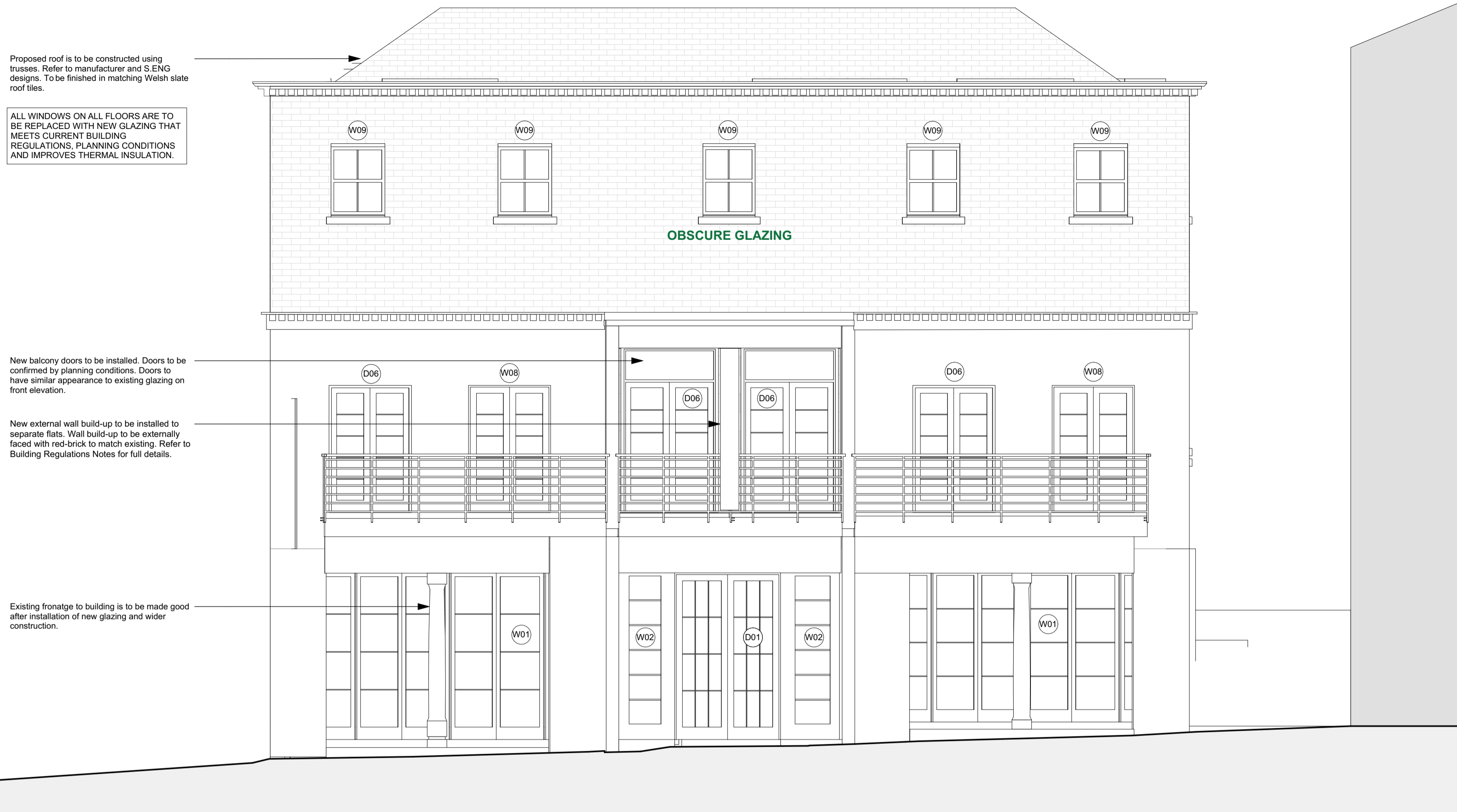
Proposed East Elevation 1:50