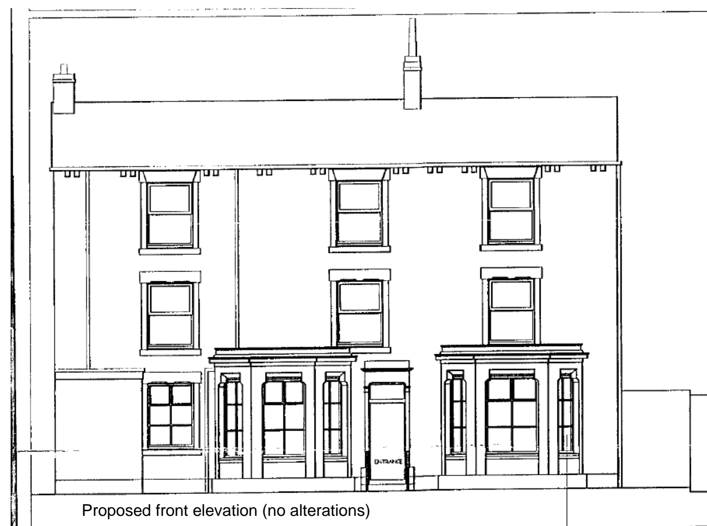
Proposed front elevation (no alterations)