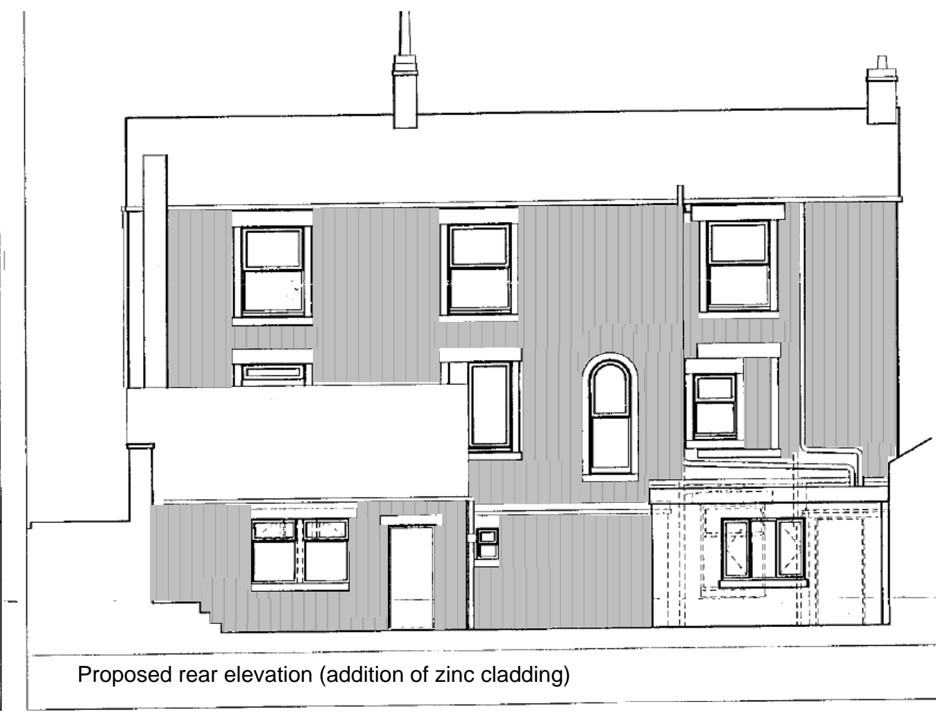
Proposed rear elevation (addition of zinc cladding)