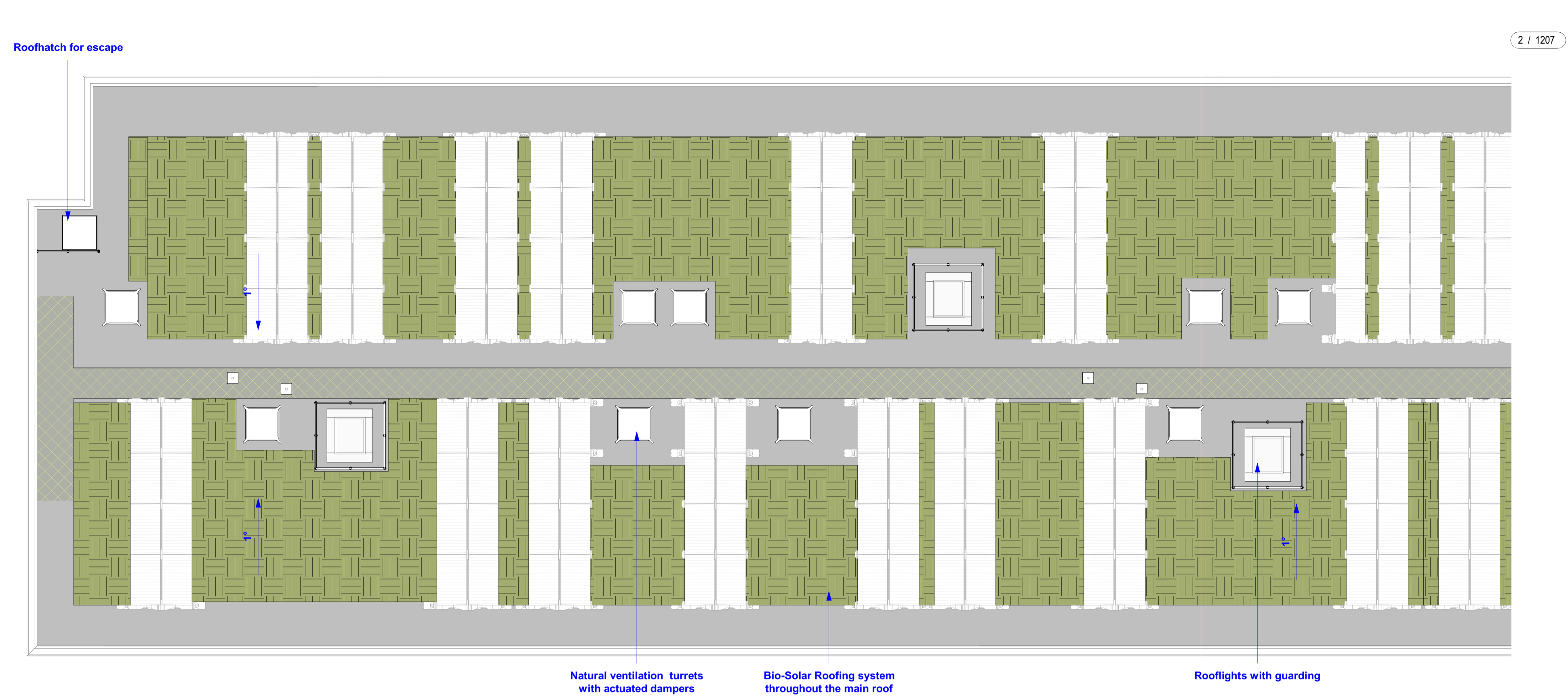
03 - Roof_GA Plan - Planning - 1 of 2