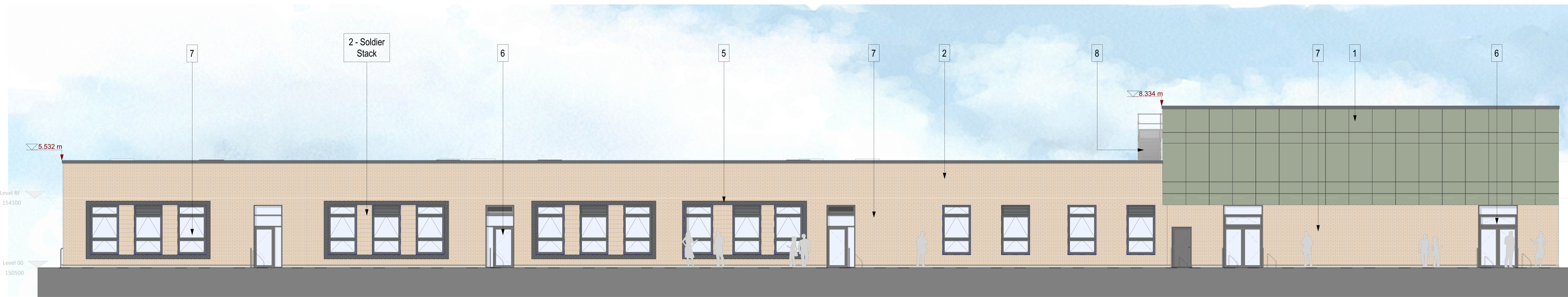
East Elevation (Rear) 1:100