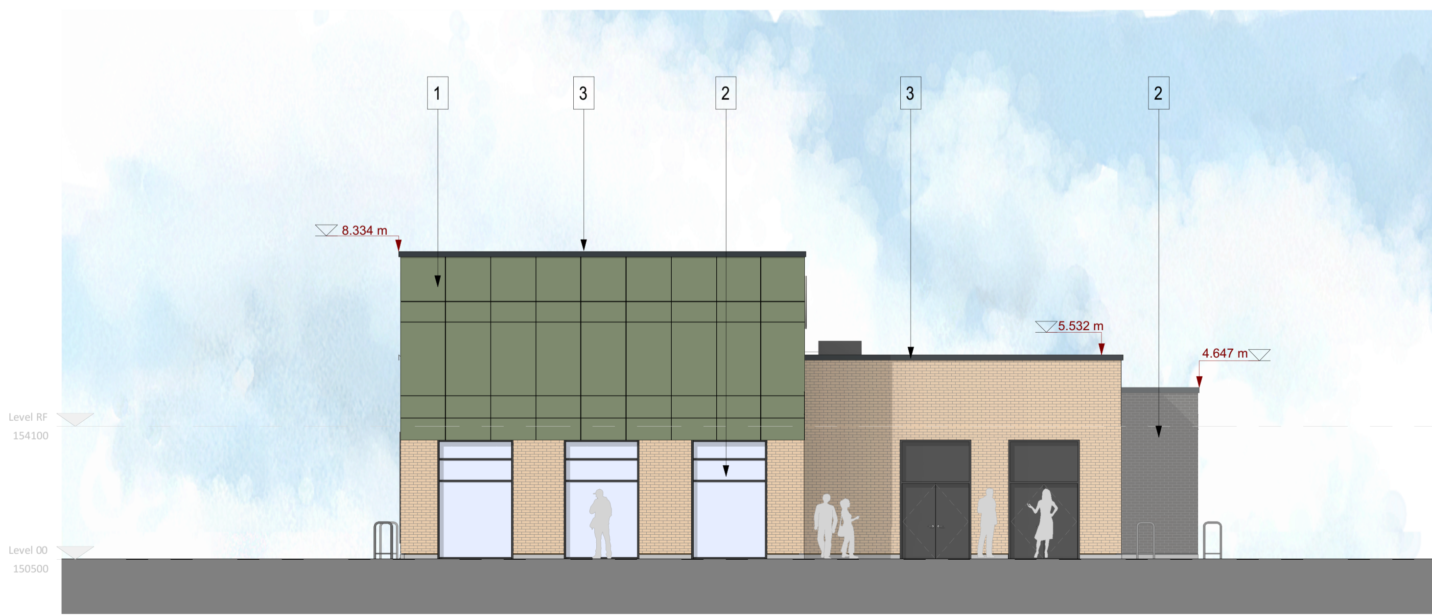
North Elevation (LHS) 1:100