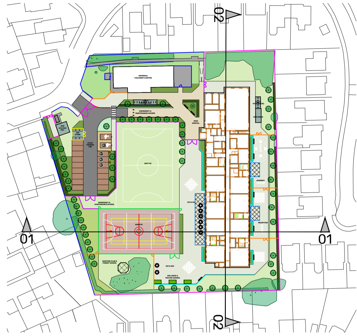
Location Plan Scale 1:1000