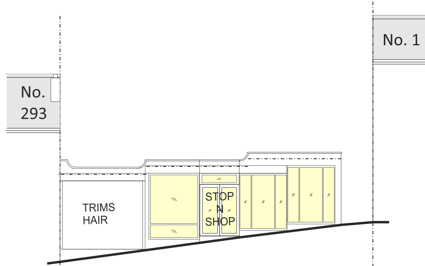
Existing Elevation South-East 'A' Scale 1:100