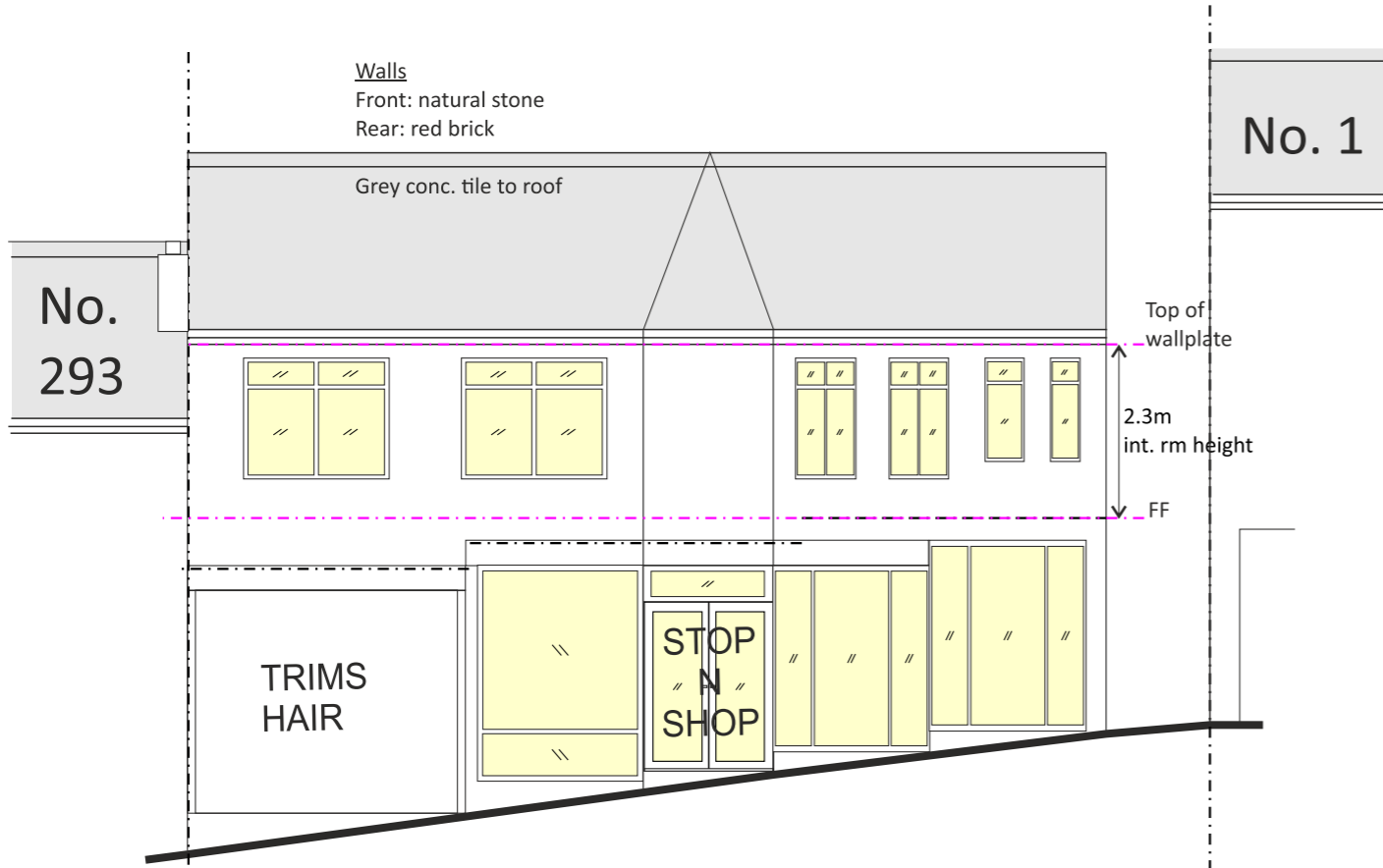
Proposed Elevation South-East 'A' Scale 1:100