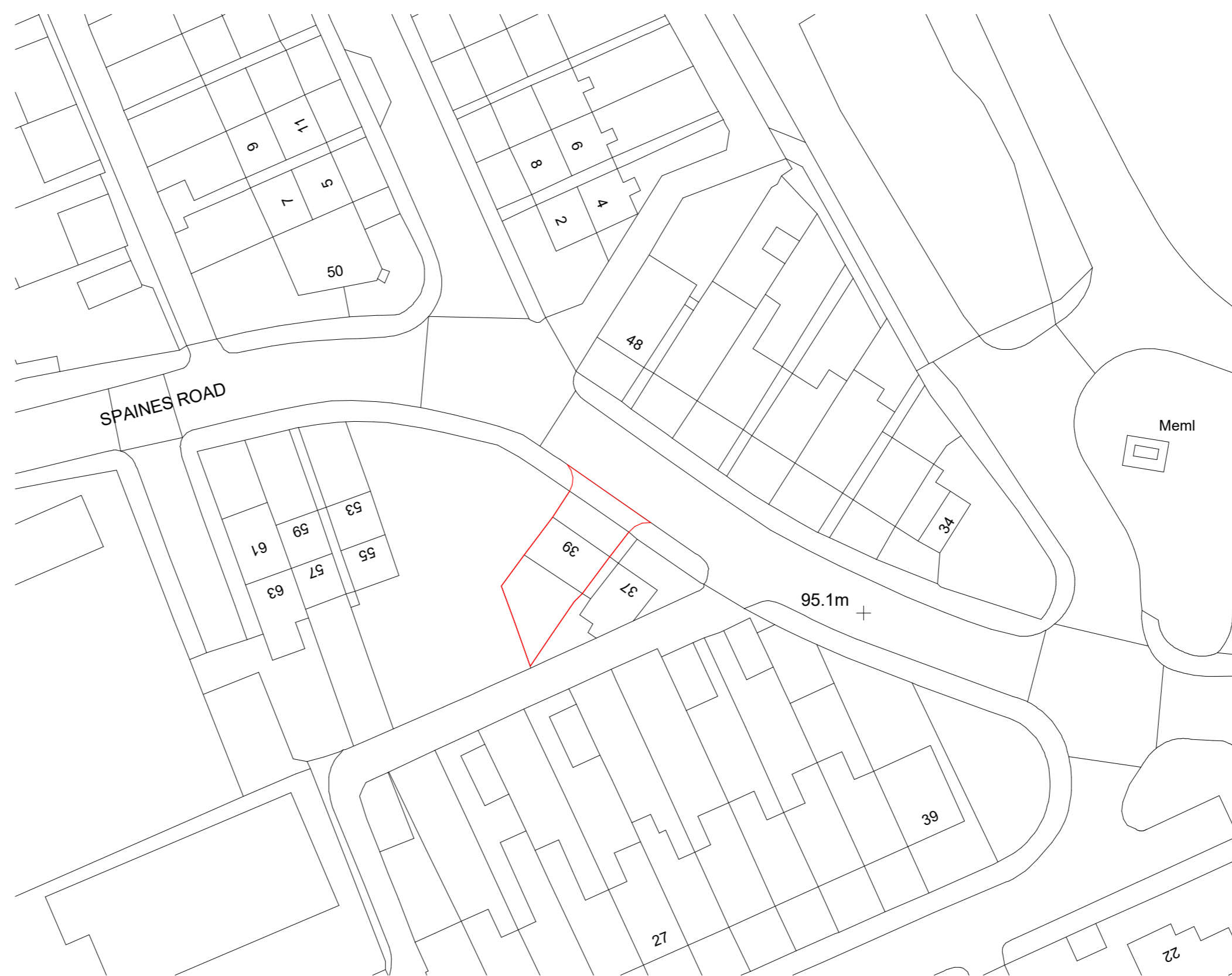
2 Site Plan 1 : 500