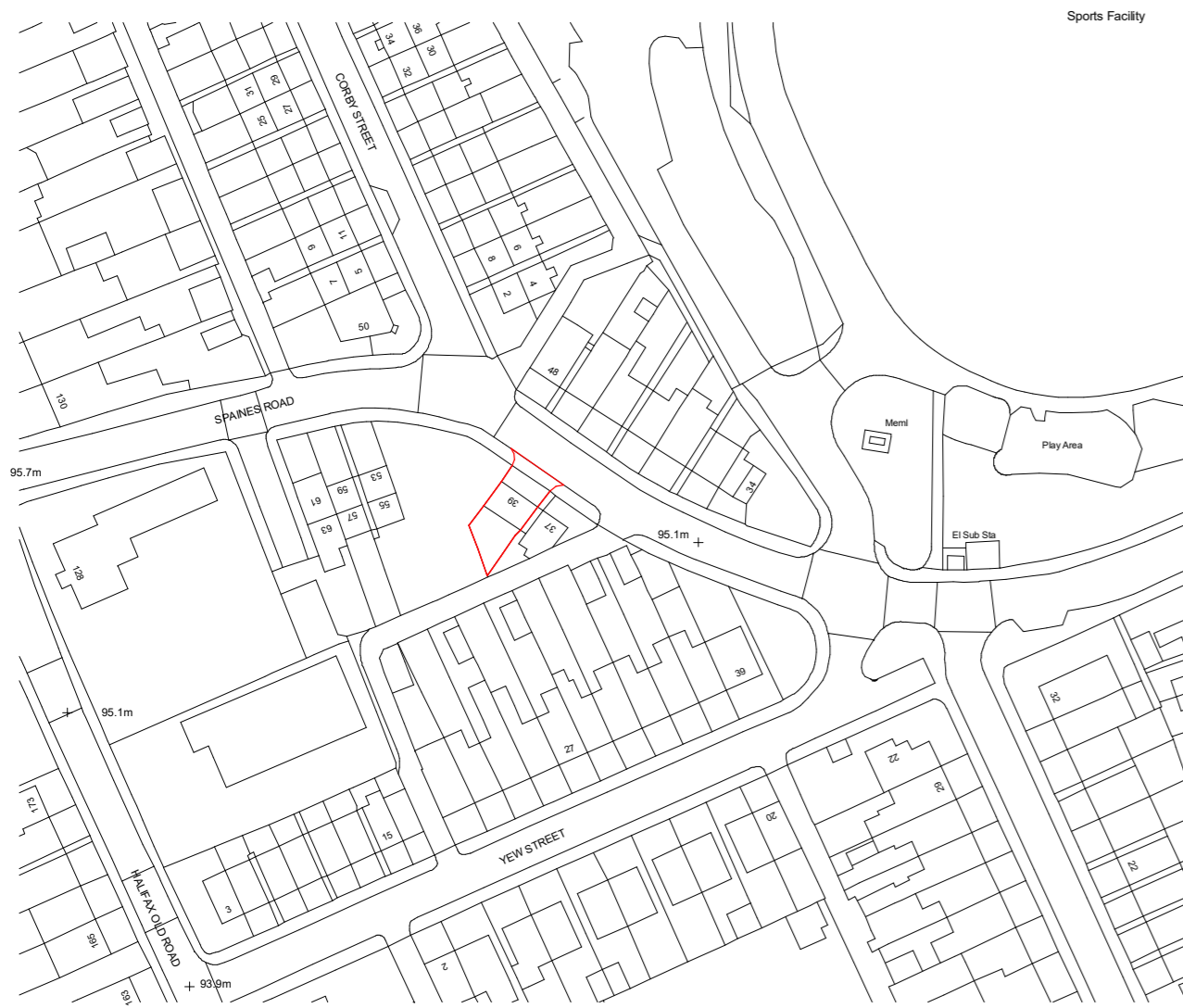
1 Location Plan 1 : 1250