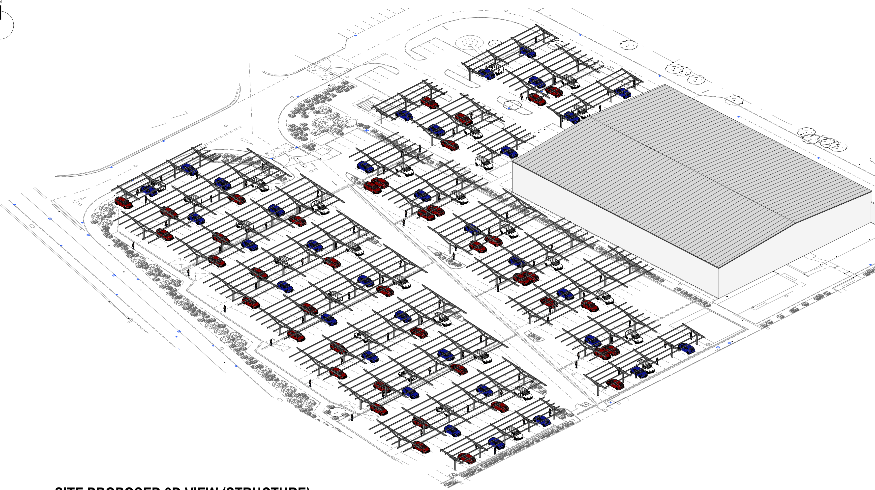
SITE PROPOSED 3D VIEW (STRUCTURE)