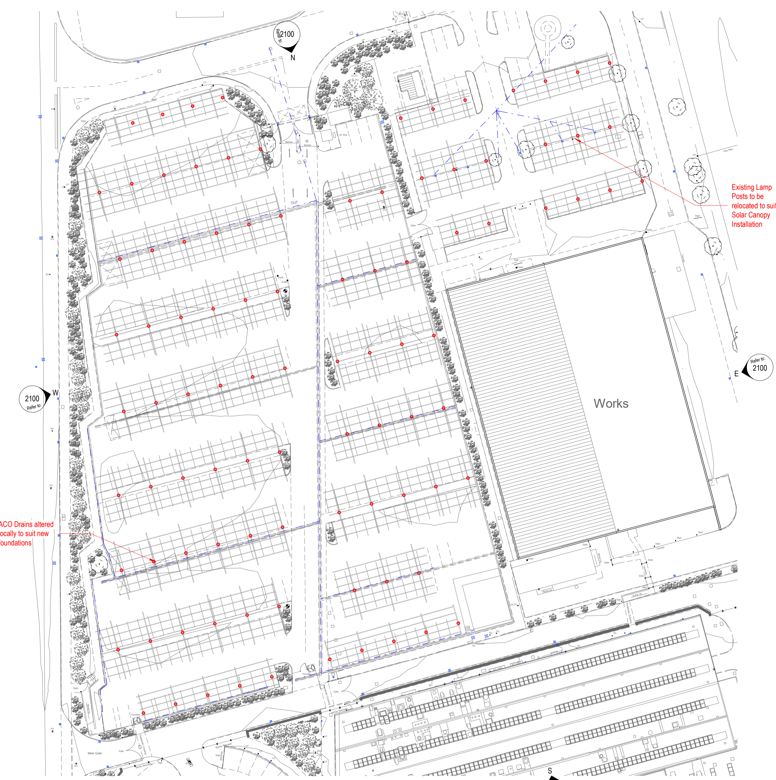
CAR PARK LAYOUT WITH PROPOSED INDICATIVE STRUCTURAL OVERLAY 1 : 500