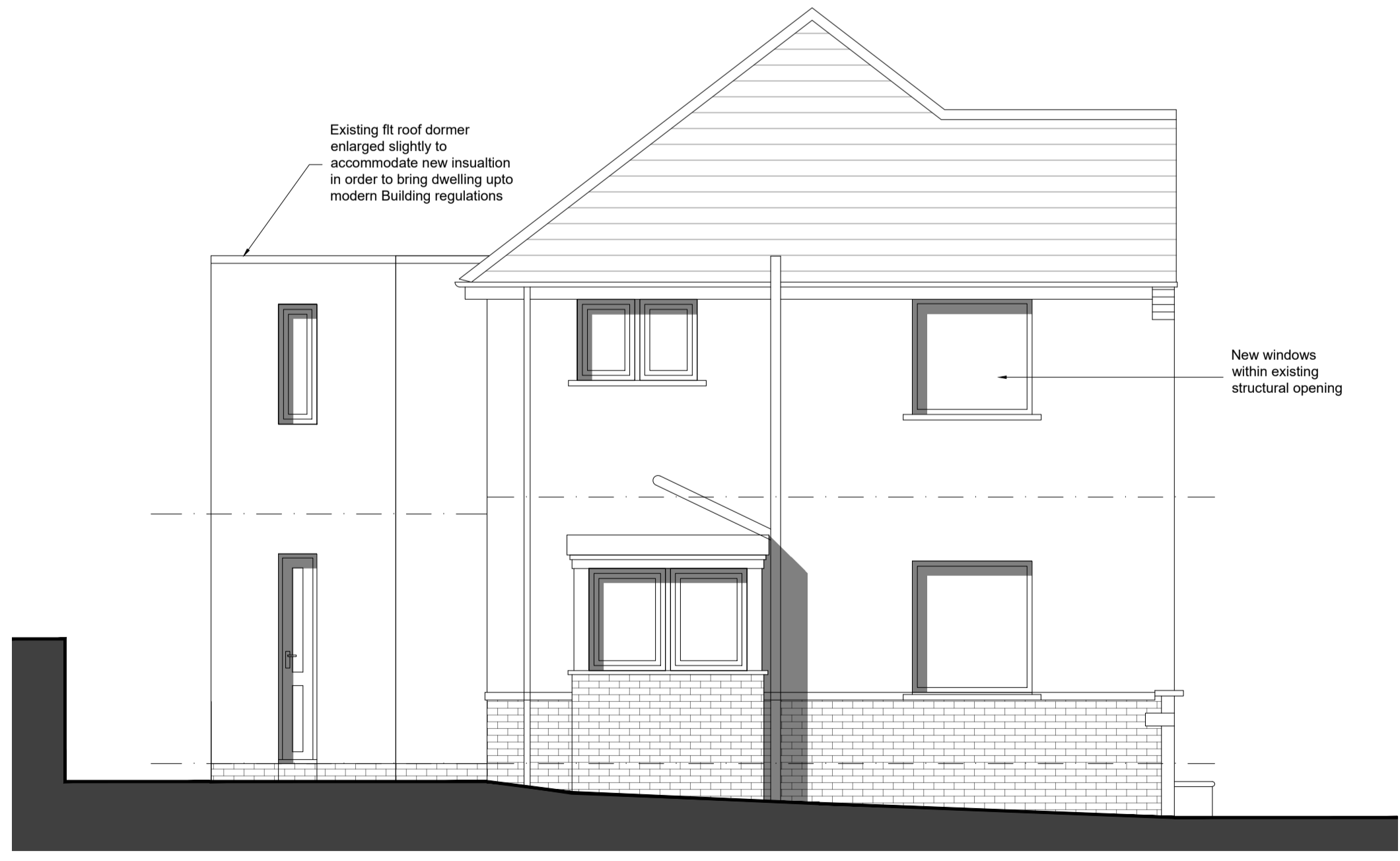
03 REAR ELEVATION (NORTH) Scale 1:50 @ A1