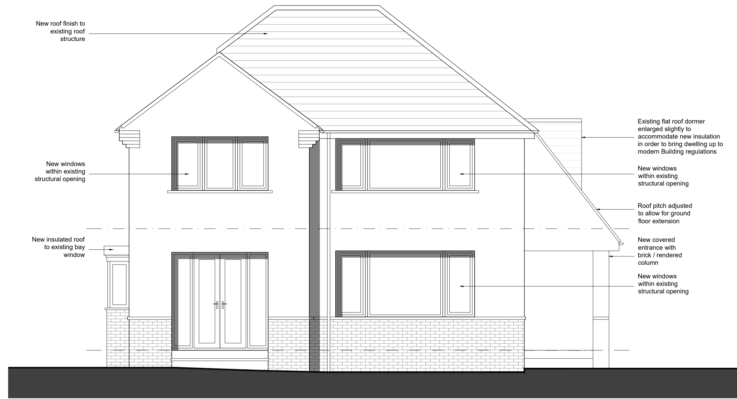
02 SIDE ELEVATION (WEST) Scale 1:50 @ A1