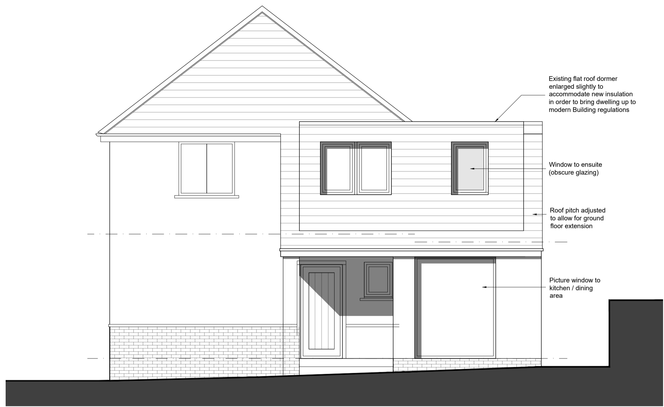
01 FRONT ELEVATION (SOUTH) Scale 1:50 @ A1