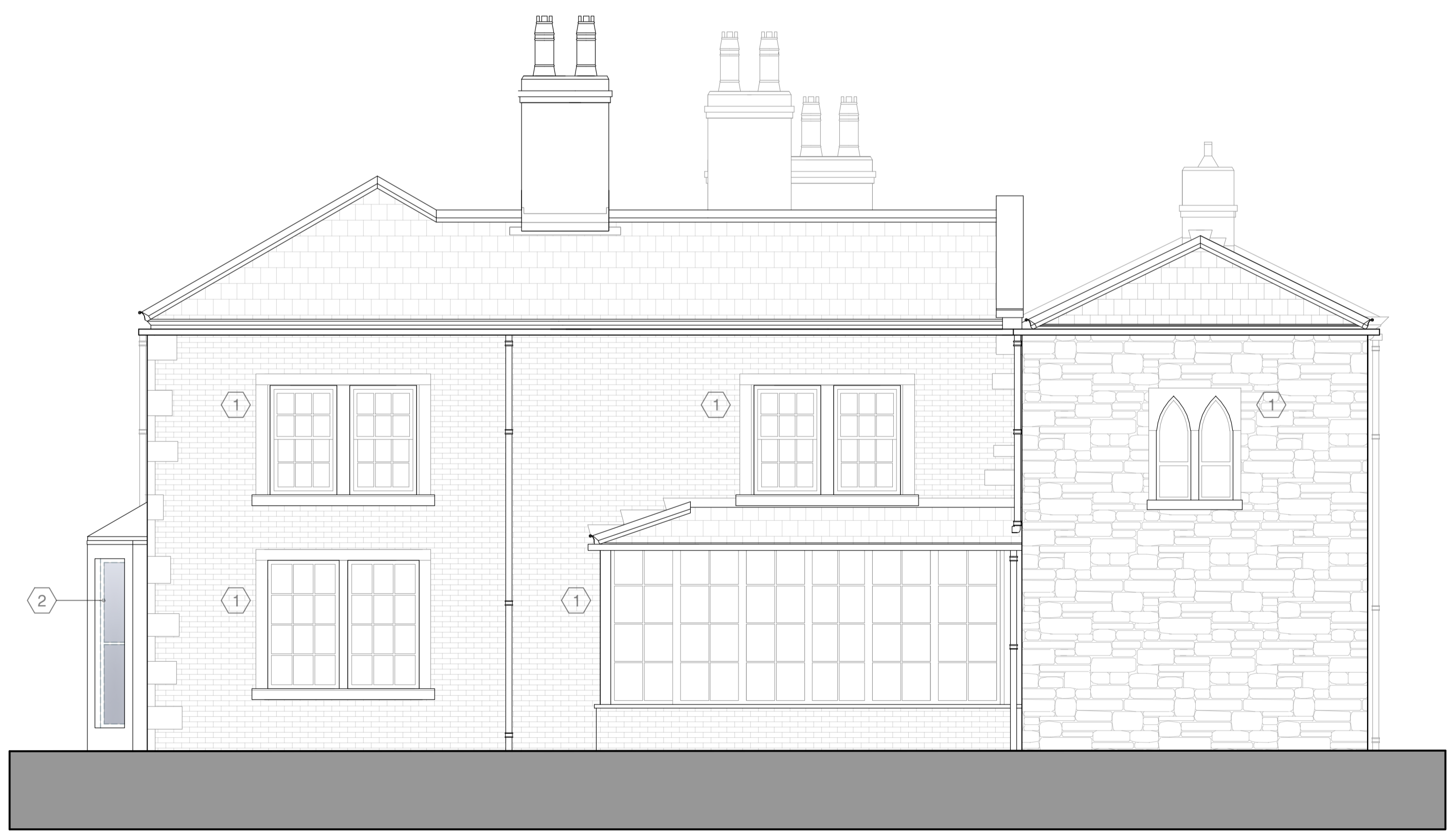
2 EAST ELEVATION AS PROPOSED SCALE 1:50