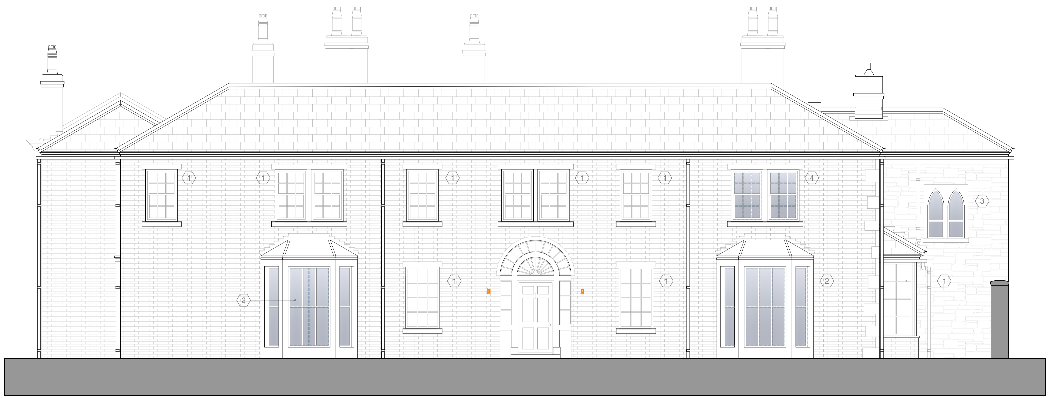
1 SOUTH ELEVATION AS PROPOSED SCALE 1:50