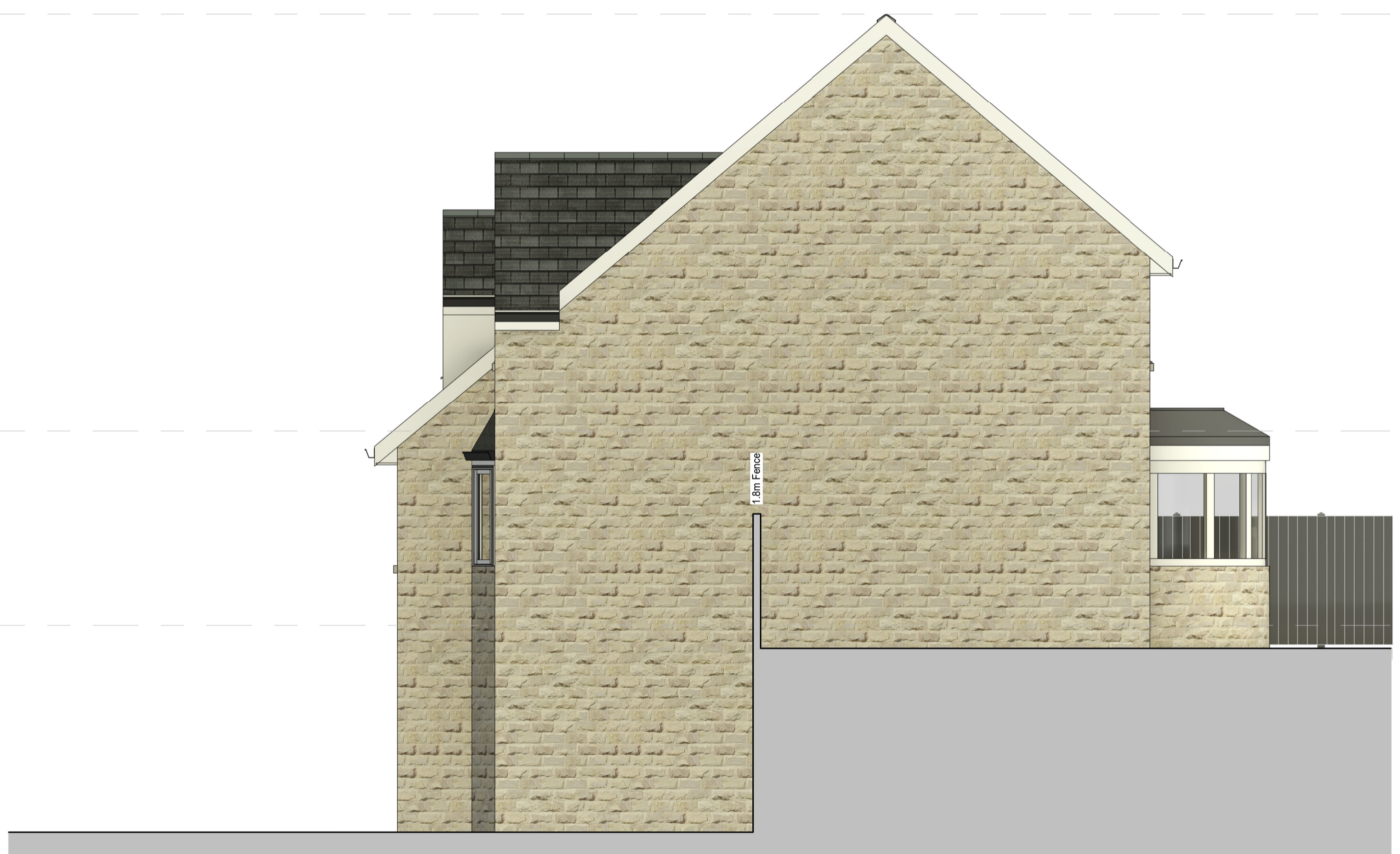
West Elevation - D