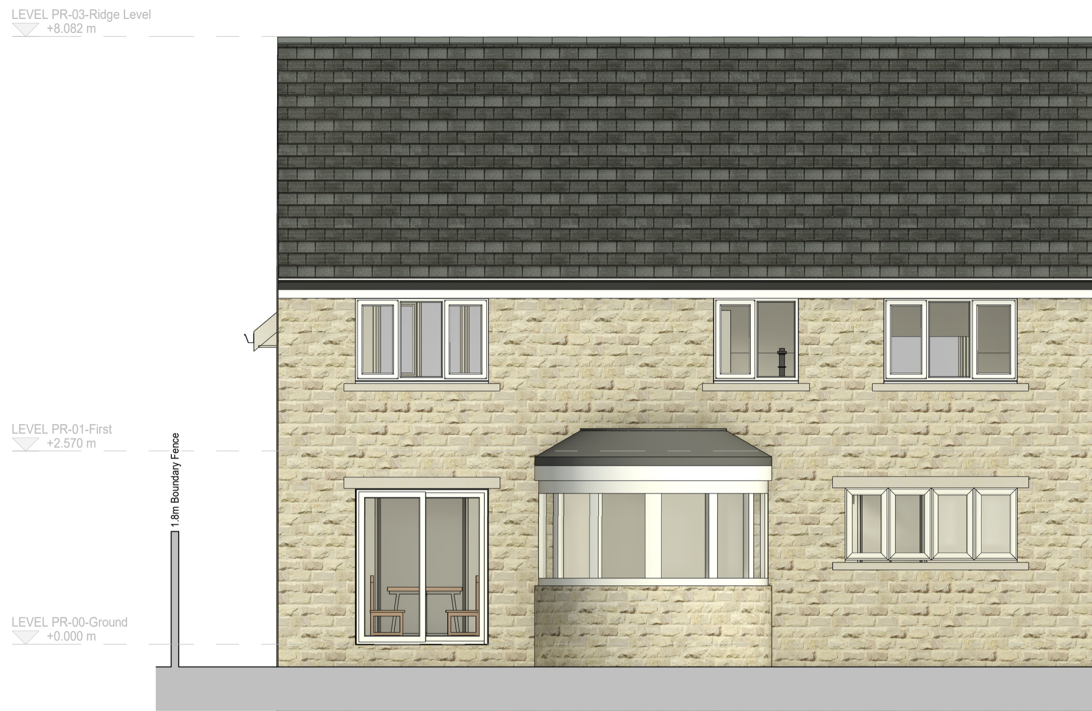
South Elevation - A