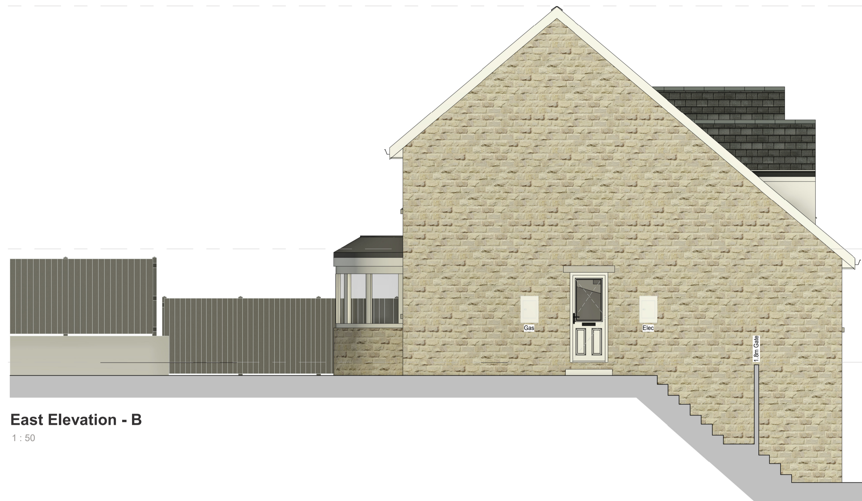
East Elevation - B