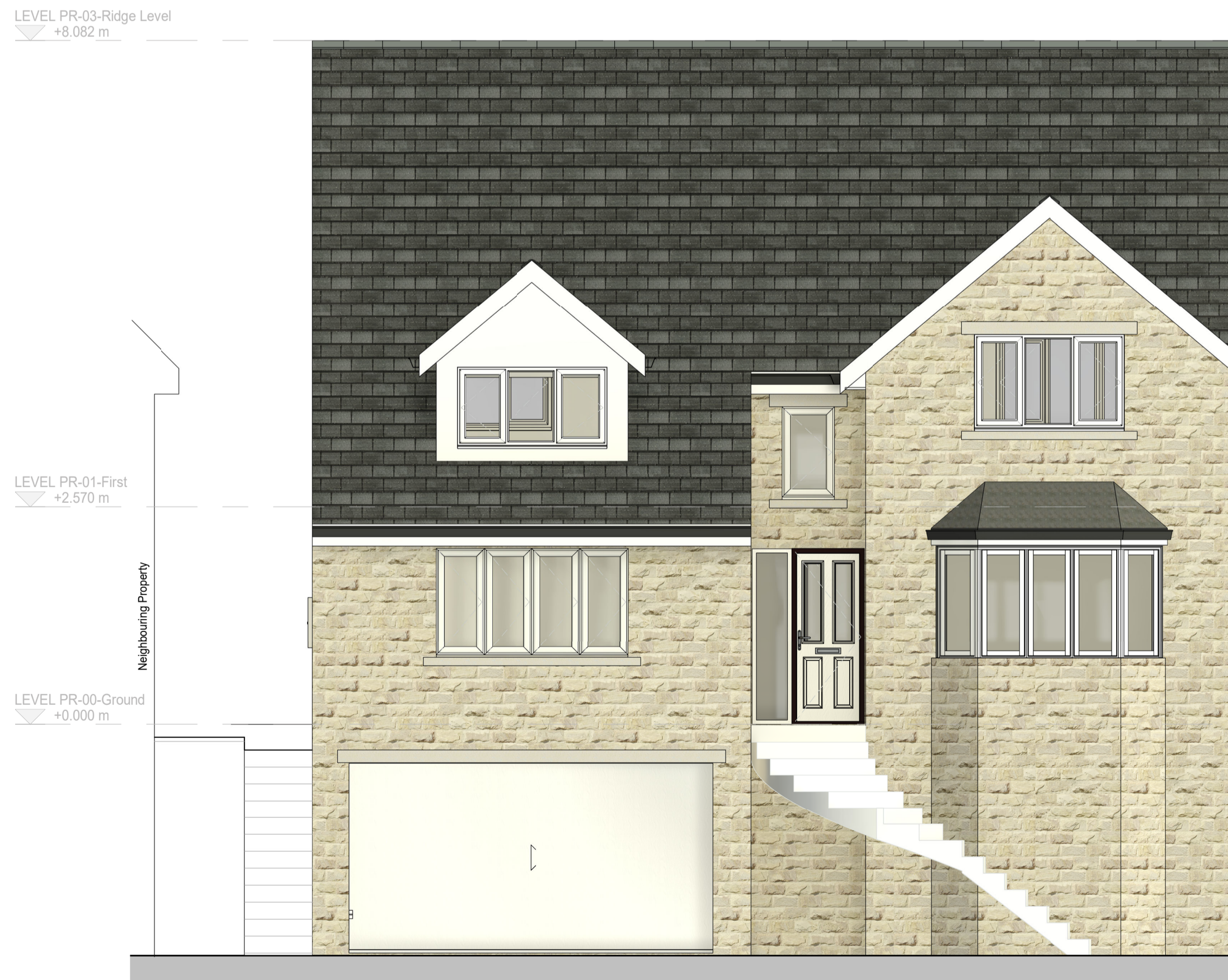
North Elevation - C