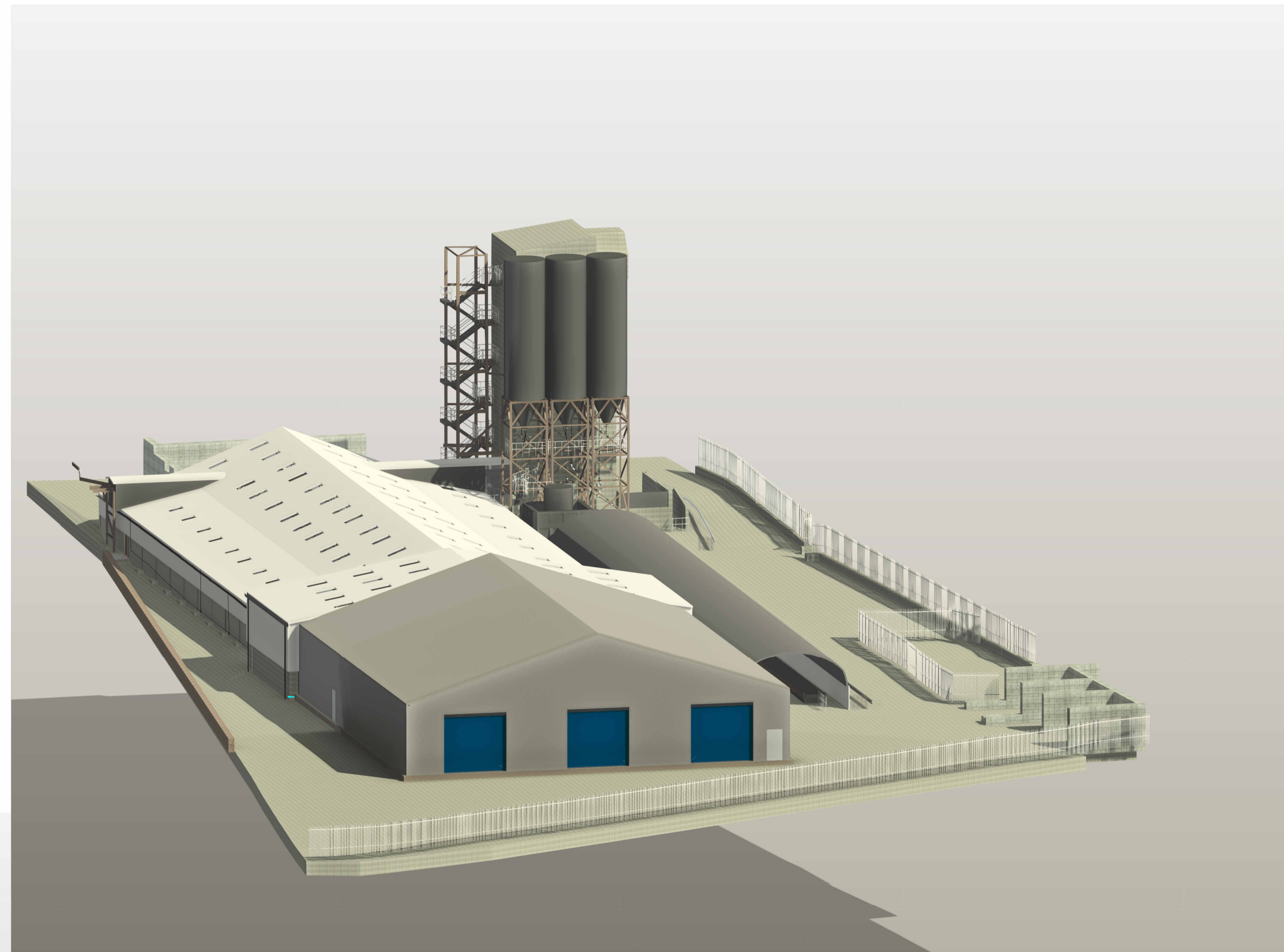
Perspective - Proposed