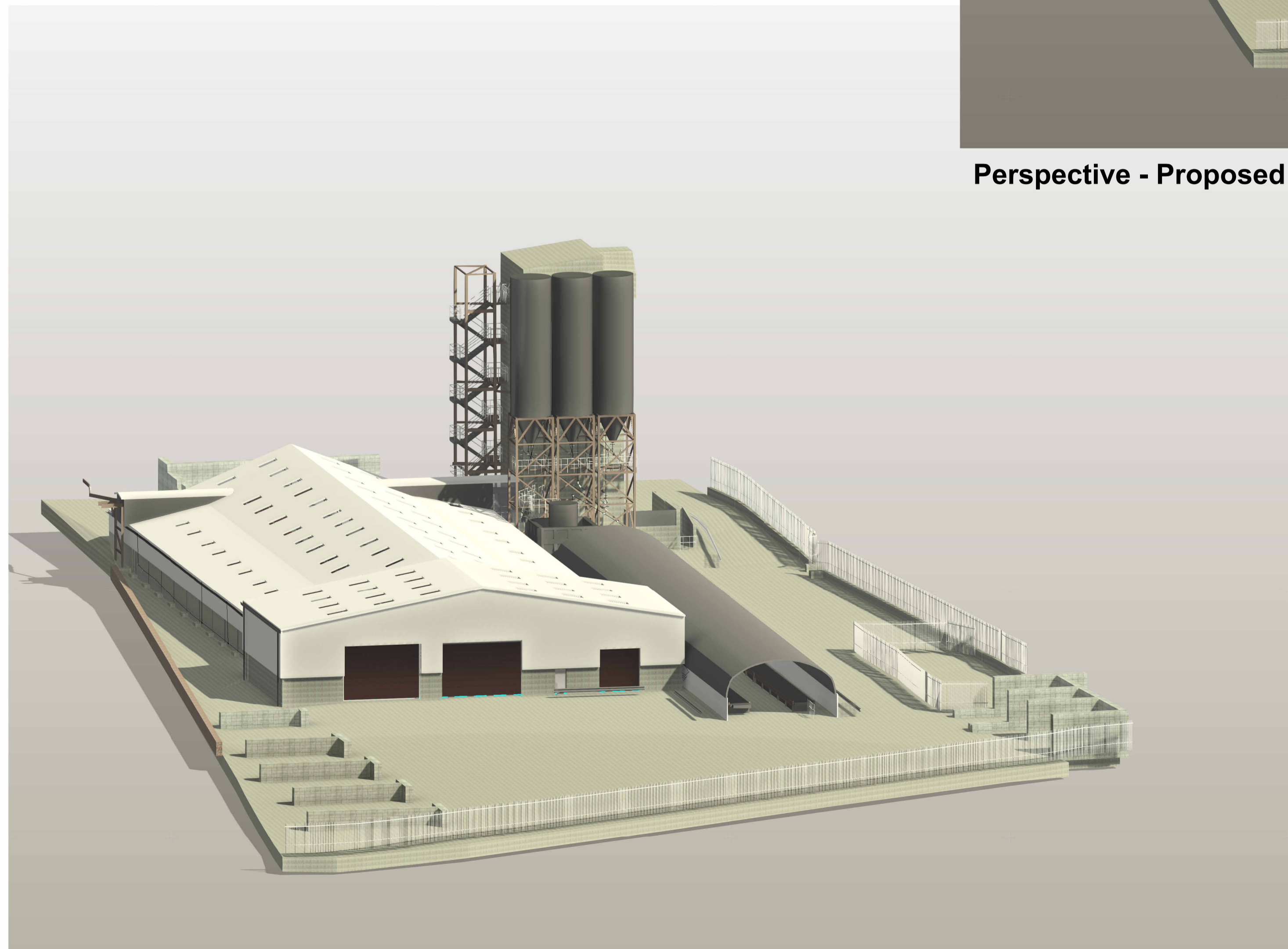
Perspective - Existing