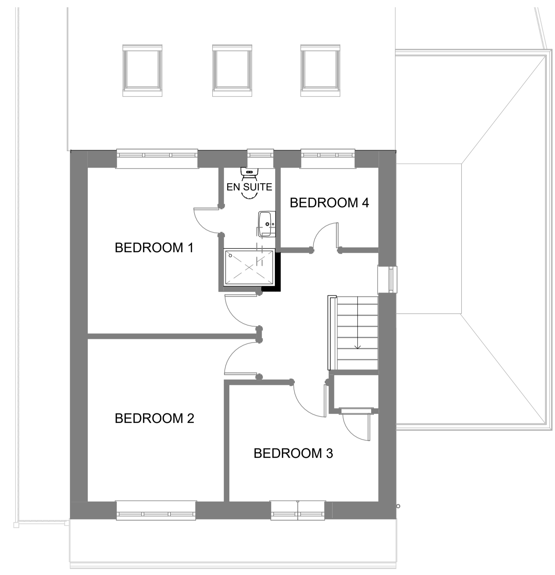
PROPOSED FIRST FLOOR 1 : 50