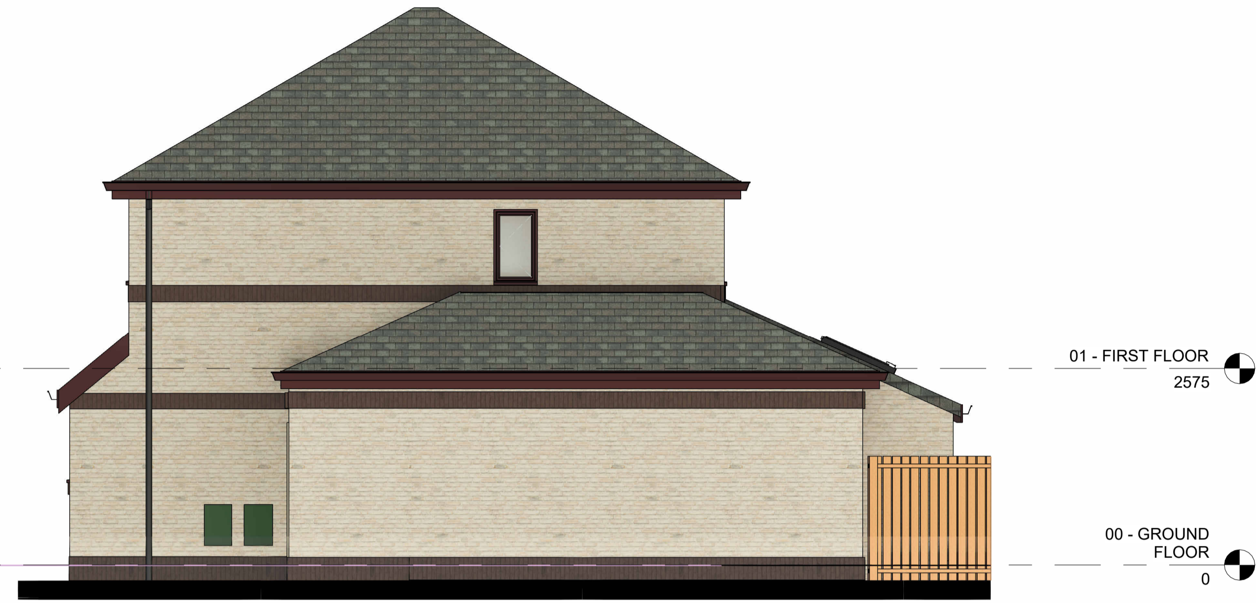
B - SOUTH-EAST PROPOSED ELEVATION SIDE 1 1 : 50