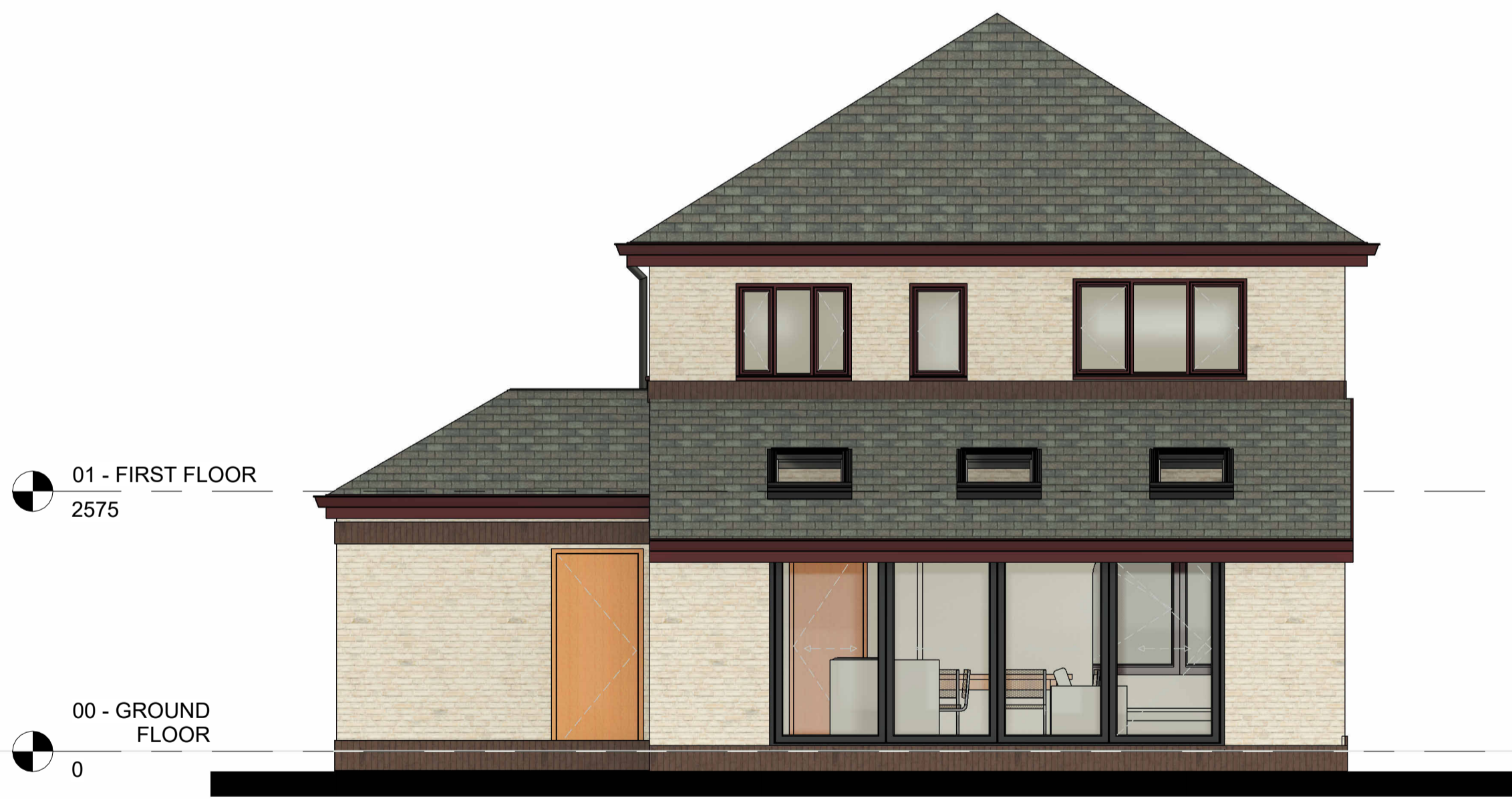
C - NORTH-EAST PROPOSED ELEVATION REAR 1 : 50