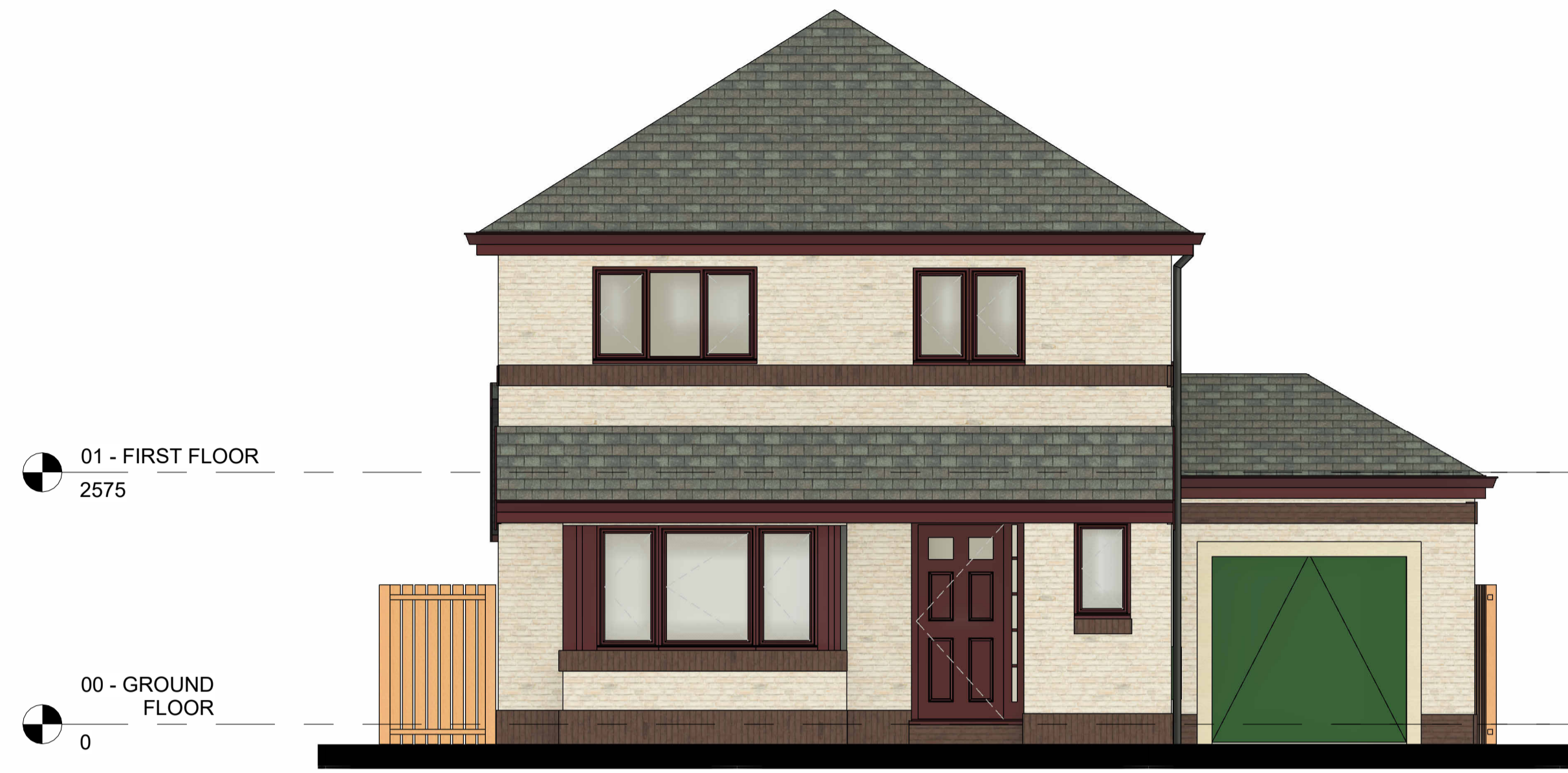
A - SOUTH-WEST PROPOSED ELEVATION FRONT 1 : 50