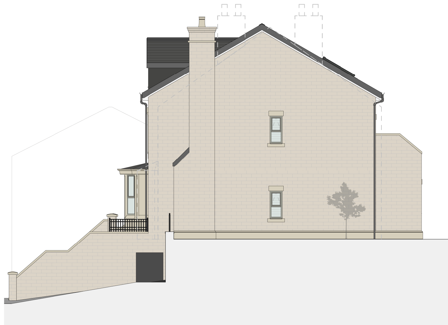
Right Elevation 1 : 100