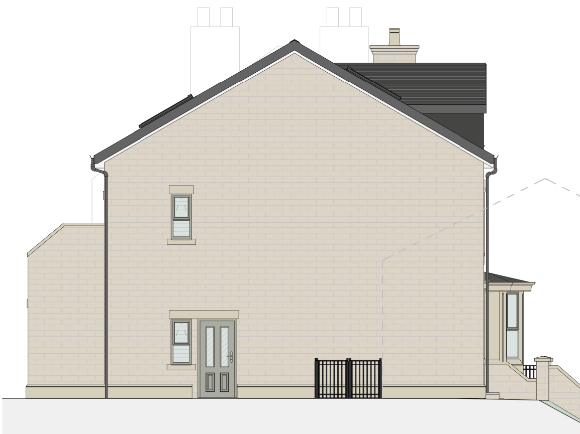
Left Elevation 1 : 100