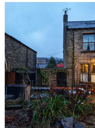
Photographs of existing building