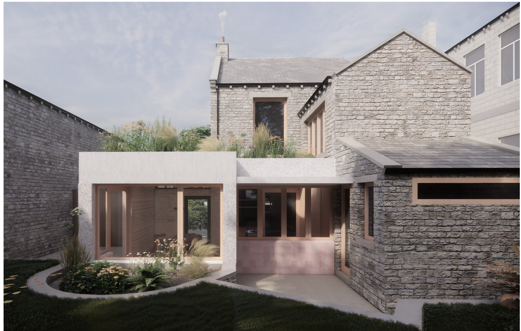
Rear view of proposal

The proposed works at Langholme have been thoughtfully designed to respect the historic fabric of the Slaithwaite Town Centre Conservation Area. Through subservient scaling, highly restricted public visibility, and the use of traditional, breathable materials, the development preserves the character of the original dwelling while offering a sustainable update to the family home