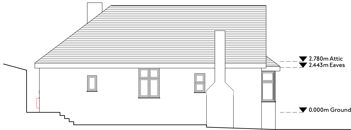
1 | 1:100 South Elevation