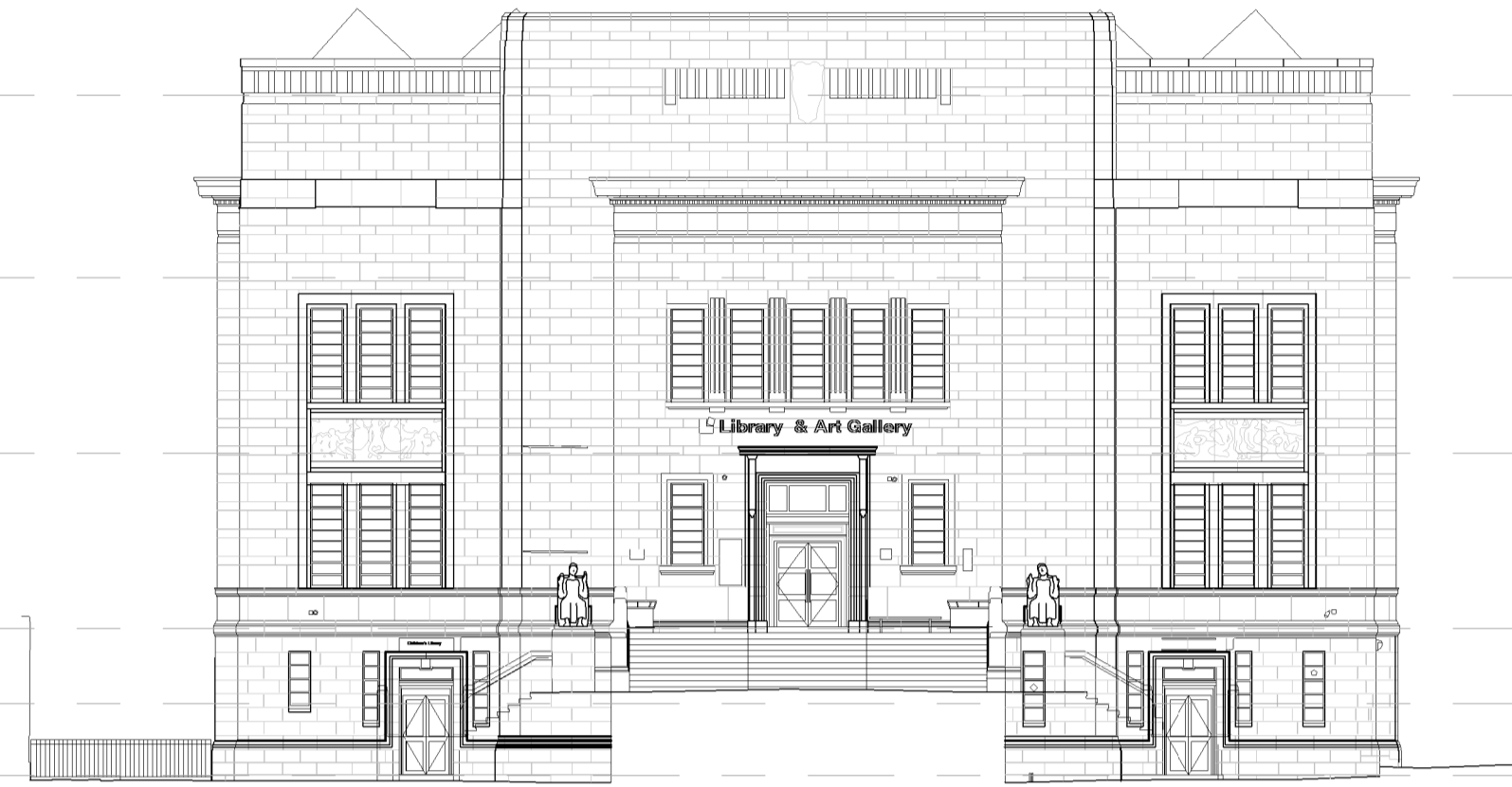
S Existing South Elevation 1 : 200